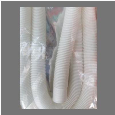
Washing Mechine Pipe