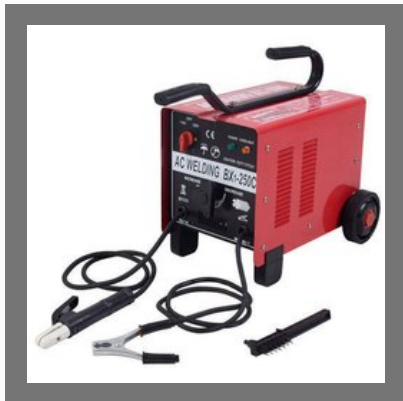
C02 Welding Machine