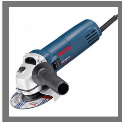
125 Mm Mini Angle Grinders