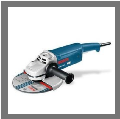
Heavy Duty Angle Grinders