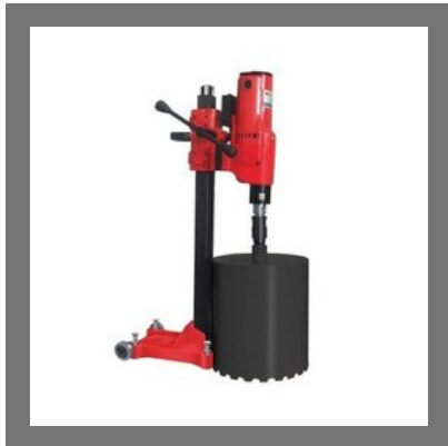
Core Cutting Machine