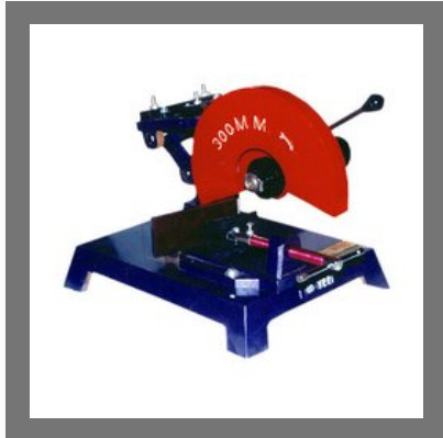
Motorized Cut-Off Machine