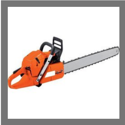
Wood Cutting Machine