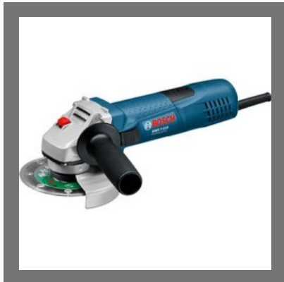
100 Mm Mini Angle Grinders