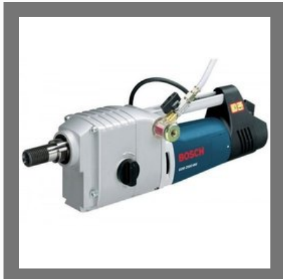
Bosch Diamond Concrete Cutter