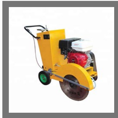
Slab Cutting with Diamond Blade