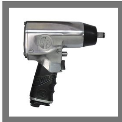
CP734H Pneumatic Tools