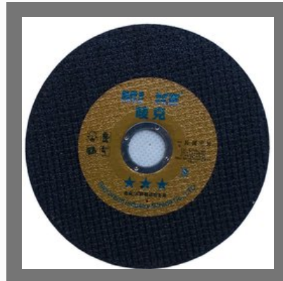
Grinding Cutting Plate