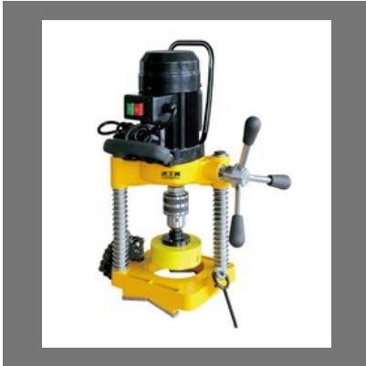
Hole Cutting Machine