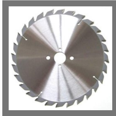
Circular Saw Blades