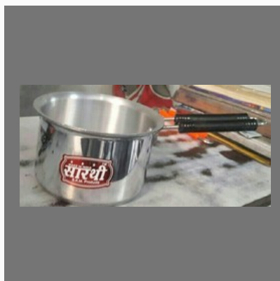
Aluminium Sauce Pan