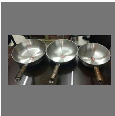
Aluminium Fry Pan