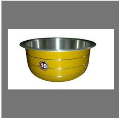
Colored Aluminum Tope