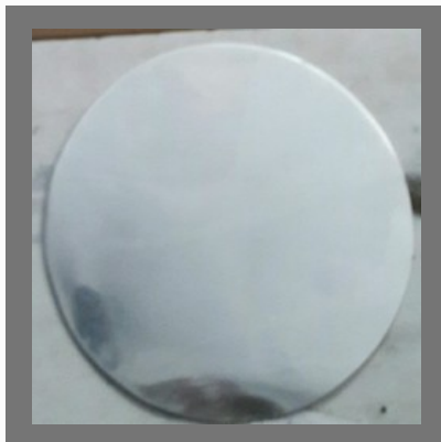
Small size Aluminum Circle