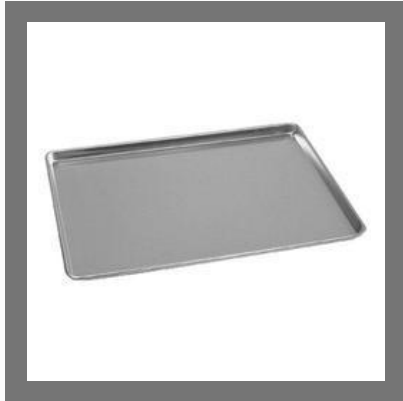
Aluminum Sheet Tray