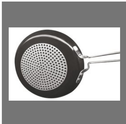
Induction Base Cookware