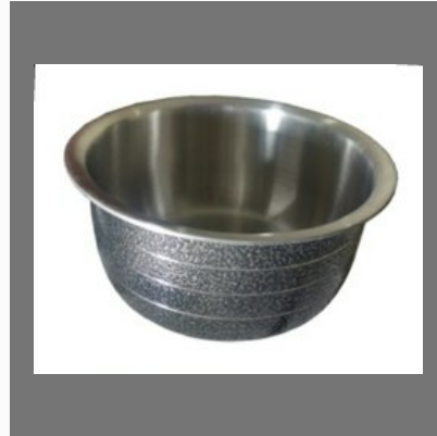
Antique silver aluminium utensils