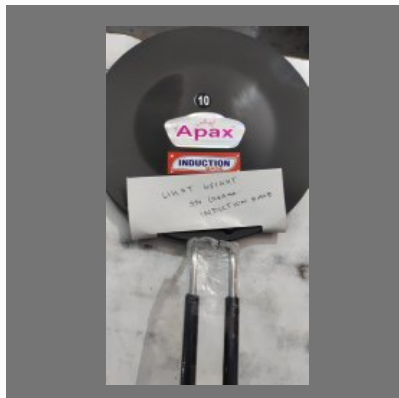
Hard Anodized Tawa