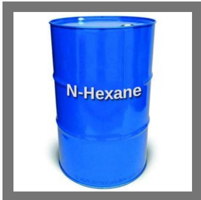
N Hexane Liquid