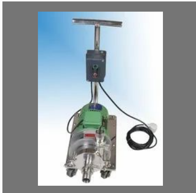
2 HP Stainless Steel Monoblock Centrifugal Pumps