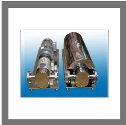
Lobe Pump for Food