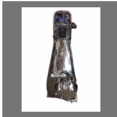
S. S. Lobe Pump - Vertical