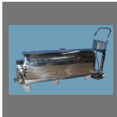
Lobe Pump With Trolley