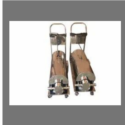
S.S. Lobe Pump with Trolley