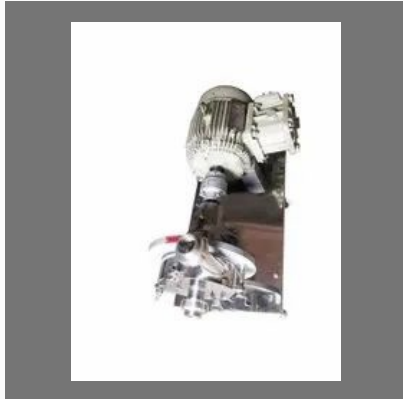
SS Centrifugal Couple Pump