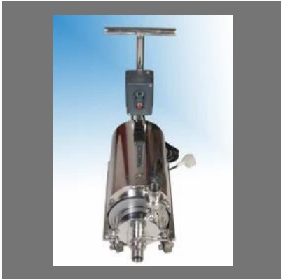
Stainless Steel Monoblock Centrifugal Pumps