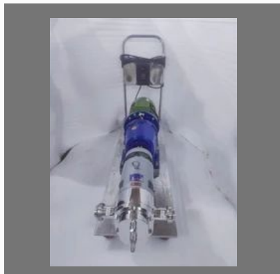
Positive Rotary Total Jacketed Lobe Pumps