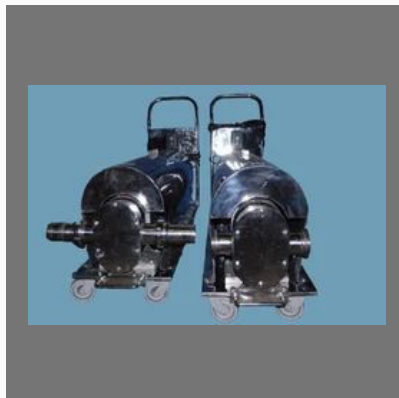
S.S. Lobe Pump