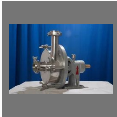
S. S. Centrifugal Pump