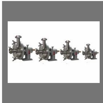
Industrial Centrifugal Pumps