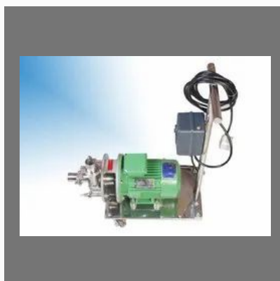
Three Phase Centrifugal Monoblock Pump