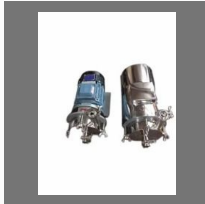
S. S. Monoblock Centrifugal Pump