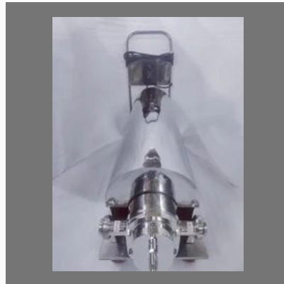
Lobe Pump Jacketed