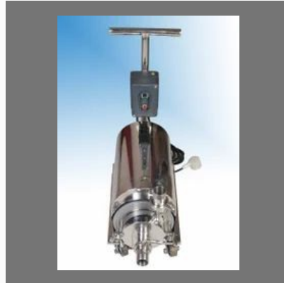
S.S. Monoblock Centrifugal Pump With Trolley