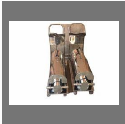
S.S. Lobe Pump