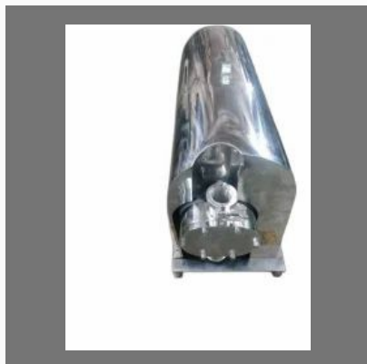
Stainless Steel Lobe Pumps