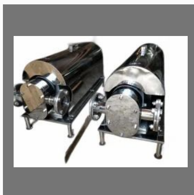
Stainless Steel Lobe Pump