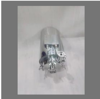
S. S. Monoblock Centrifugal Pump with Trolley