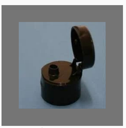
Flip Top Caps