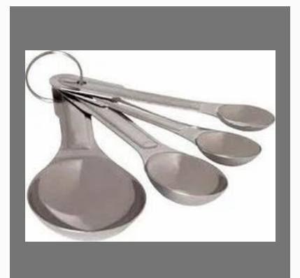
Polypropylene Measuring Spoon