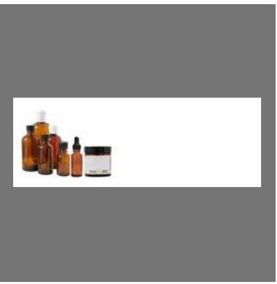
Ointment Lotion Caps And Bottles