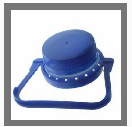
HDPE Bottle Caps