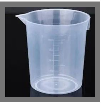
Plastic Measuring Cups