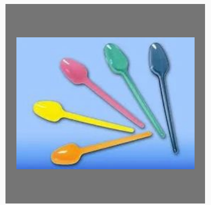
Spoons For Single-Time Usage