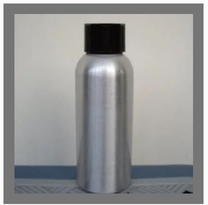
Aluminium Bottle Caps