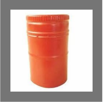
Aluminum Wine Bottle Cap