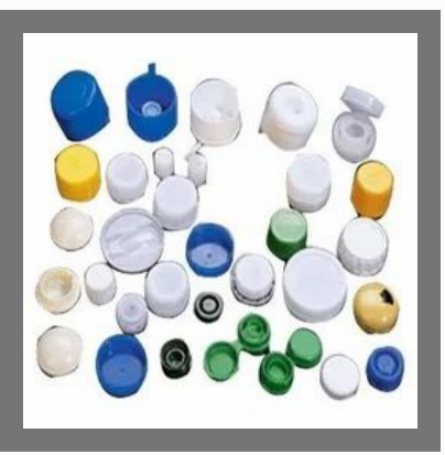
Pet Bottle Caps