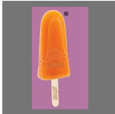
Orange Ice Cream Bar