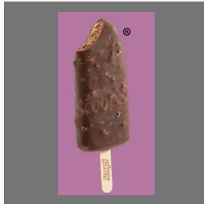
Choco Almond Ice Cream Bar