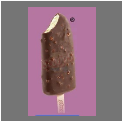
Crunchy Ice Cream Bar