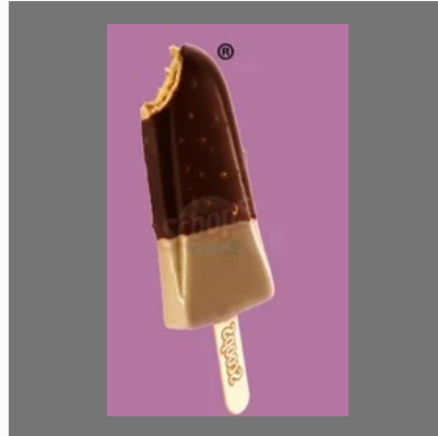
Coffee Toffee Ice Cream Bar