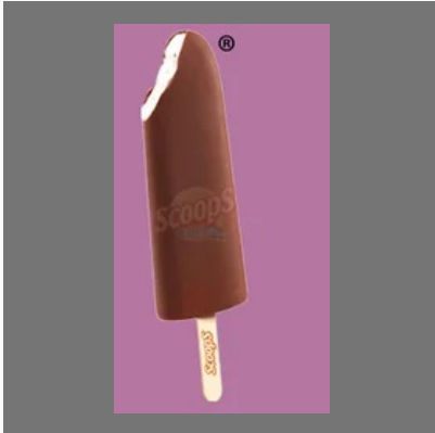
Chocolate Ice Cream Bar