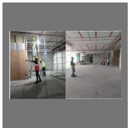
Armored HT/ LT Fire Alarm Wiring And Termination Work