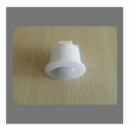
PIR Motion Sensor