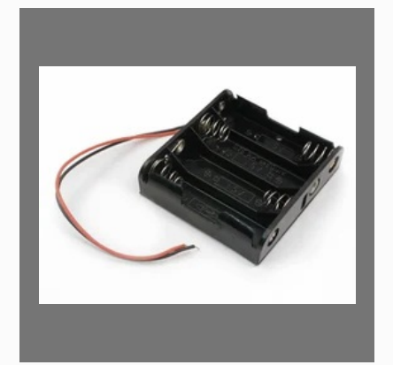
AA Battery Holders