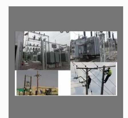
Electrical Substation Work And Line Transmission