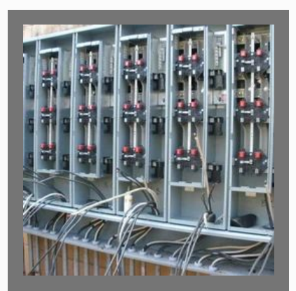
Commercial Electrical Works