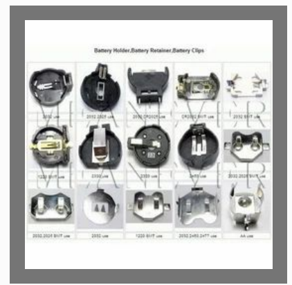
Coin Cell Battery Holder