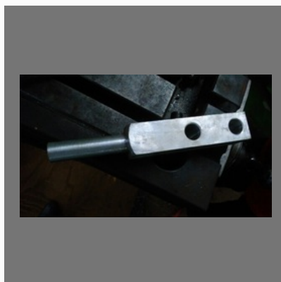
Pouch Packaging Machine Parts