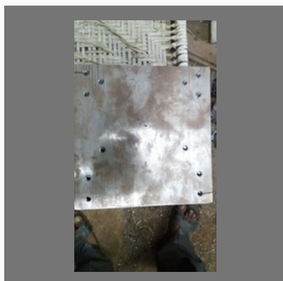
Custom Die Molds