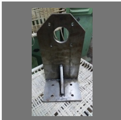
High Precision Die Casting