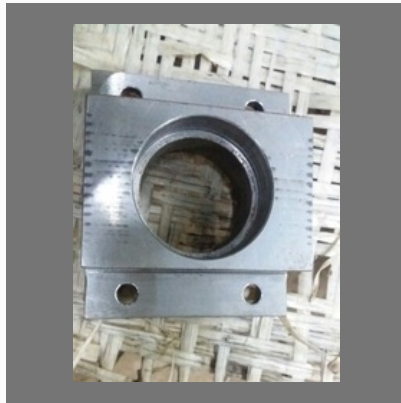
Aluminium Die Casting