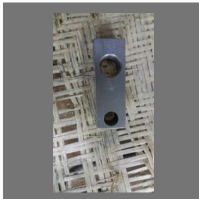
Blow Mold Die