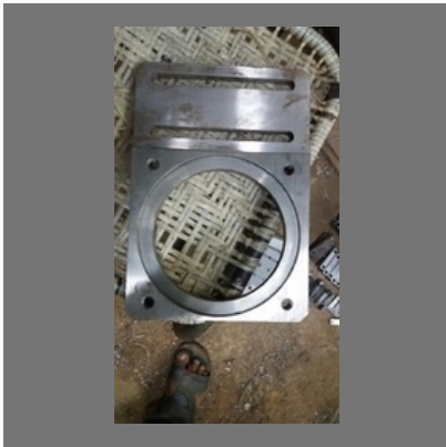
Die Casting Parts