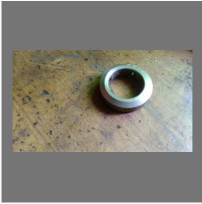
Stainless Steel Collars