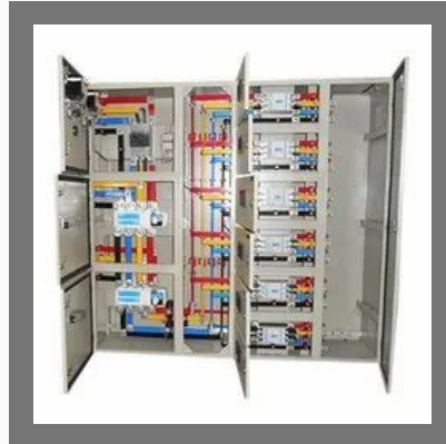
LT Distribution Panel