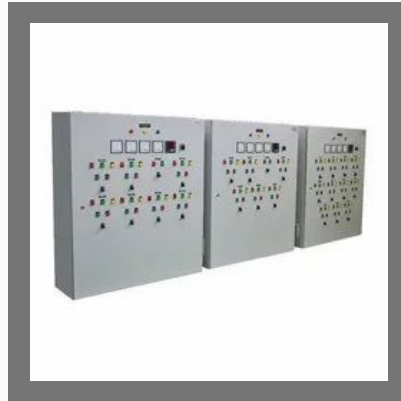
Star Delta Starter Control Panel