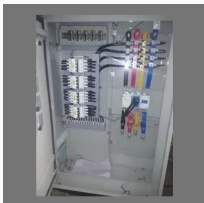
Electrical Distribution Box