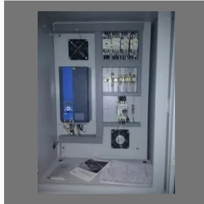
AHU Control Panel