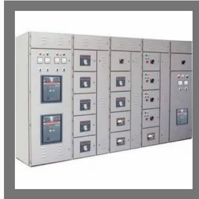
Automatic DG Set Control Panel