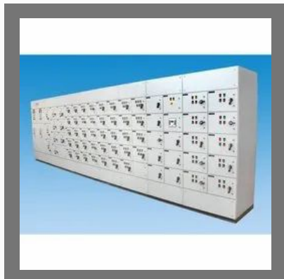
MCC Control Panel