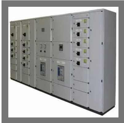
Low Tension Panel