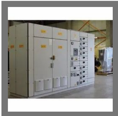
Power Factor Correction Panel