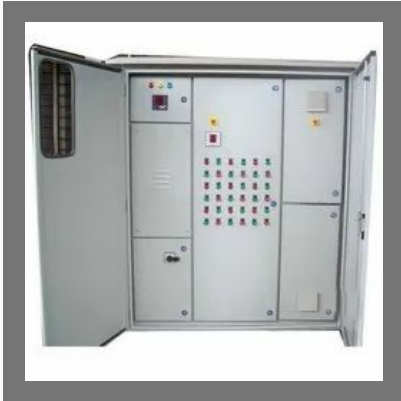
APFC Control Panel