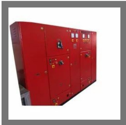
Fire Alarm Control Panel