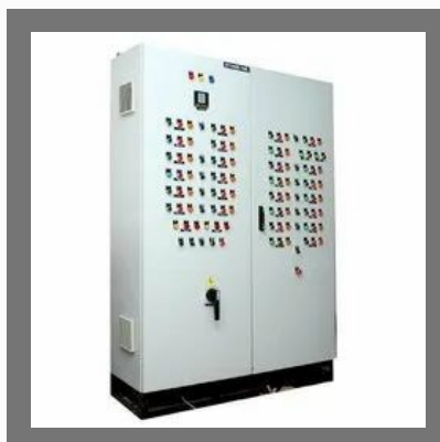
Automatic Mild Steel MCC Panel