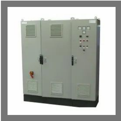
DG Set Control Panel