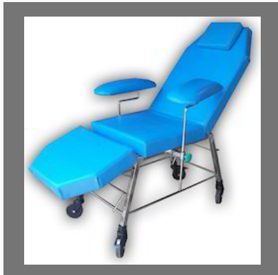
Blood Donation Chair