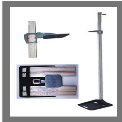
Folding Height Measuring Stand