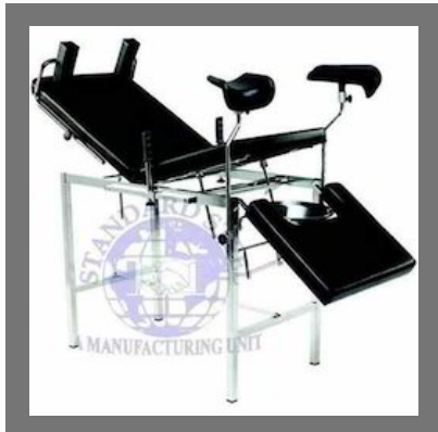
Gynecological Examination Bed