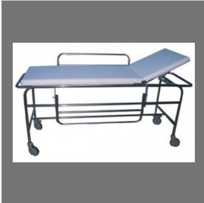
Adjustable Patient Stretcher