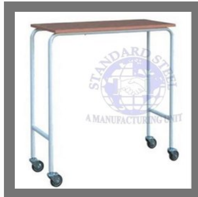
Patient Over Bed Table