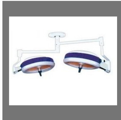
Double Dome OT Light