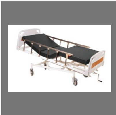
Electric ICU Bed