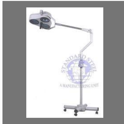
Hospital Examination Light