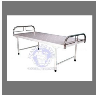
Hospital Plain Bed