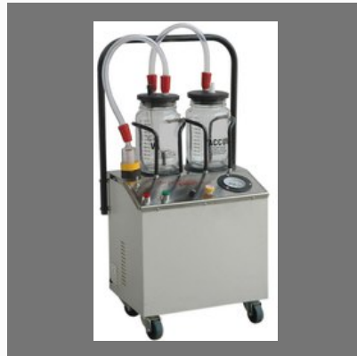
Surgical Suction Machine