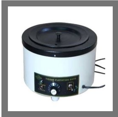
Tissue Floatation Bath