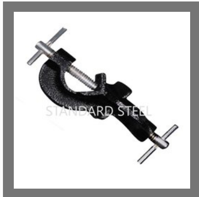
Boss Head Clamp