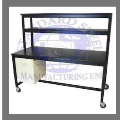
Laboratory Work Bench