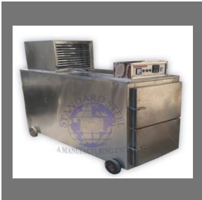
Dead Body Mortuary Chamber