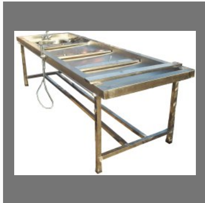
Stainless Steel Autopsy Dissection Table