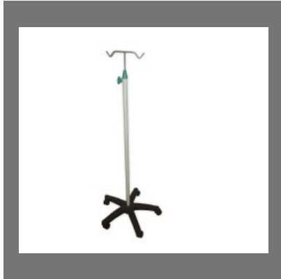
Hospital Saline Stand