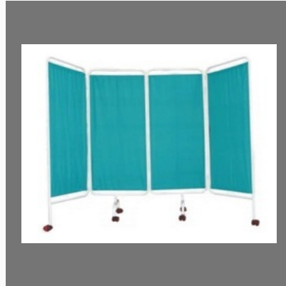
Hospital Bed Side Screen