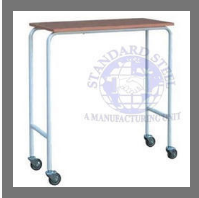
Hospital Overbed Table