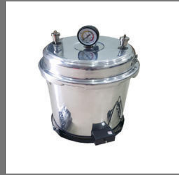
Non Electric Autoclave