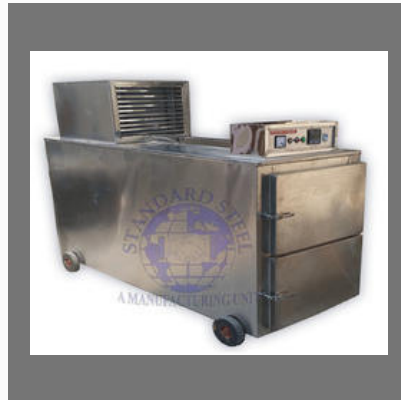
2 Body Mortuary Chamber