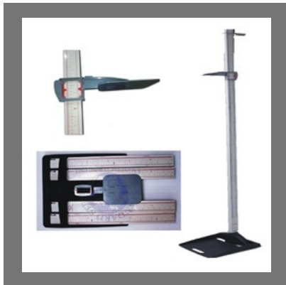
Portable Height Measuring Stand