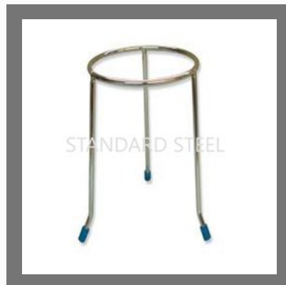
Lab Tripod Stand