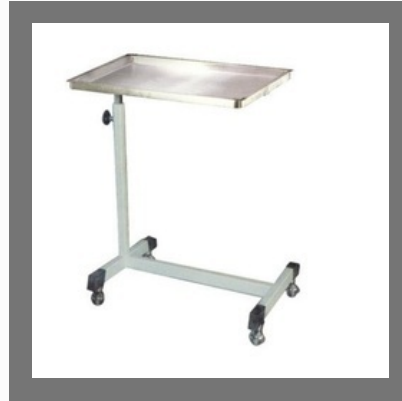
Mayo Instrument Trolley