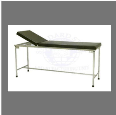
Adjustable Examination Table