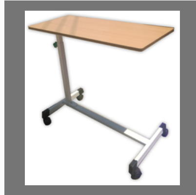
Adjustable Overbed Table