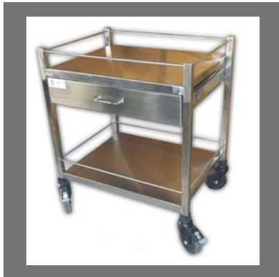
Stainless Steel Medicine Trolley