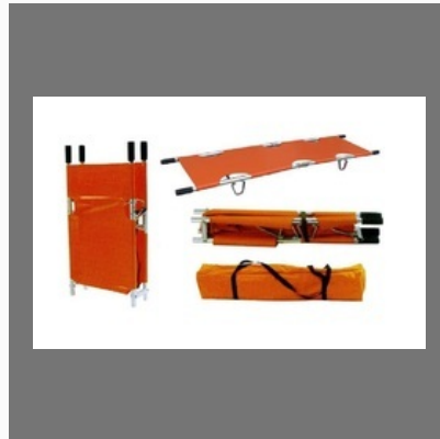
Two Fold Stretcher