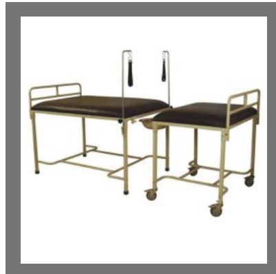
Obstetric Delivery Bed