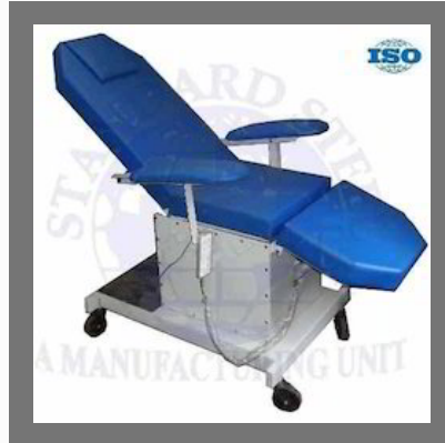
Blood Donor Couch