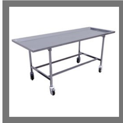
Folding Autopsy table