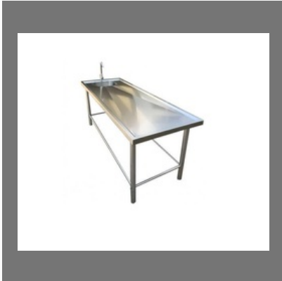
Autopsy Postmortem Table