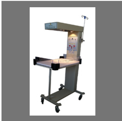
Infant Radiant Warmer