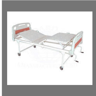
Hospital Full Fowler Bed