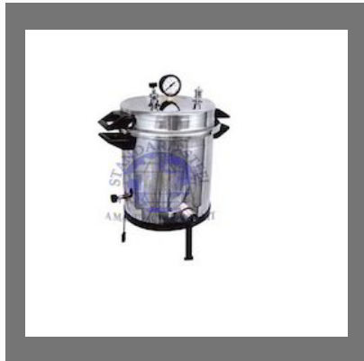
Standard Steel Portable Autoclave