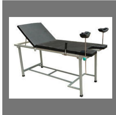
Adjustable Delivery Bed