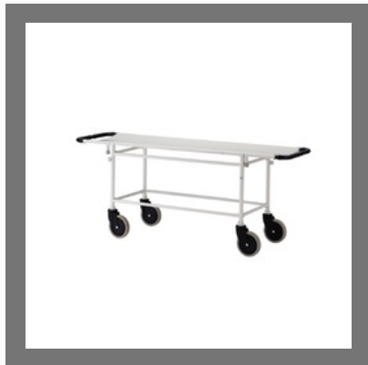
Dead Body Transfer Stretcher