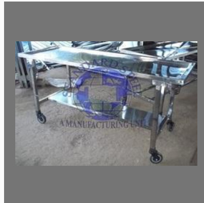
Mortuary Transfer Table