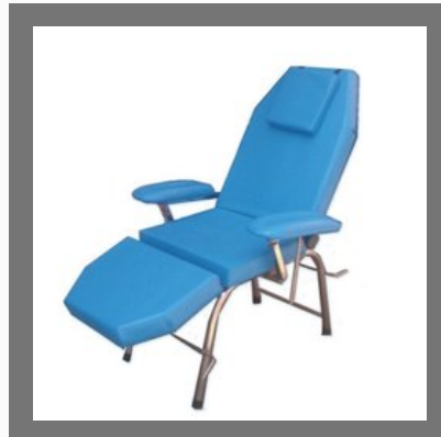
Hospital Blood Collection Chair