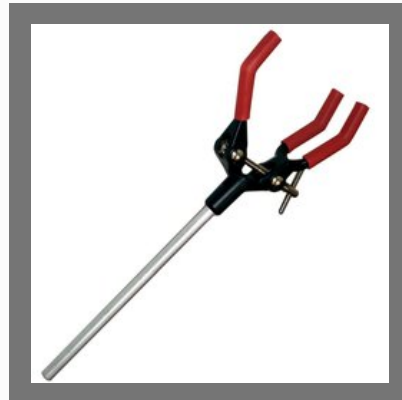
Three Finger Clamp