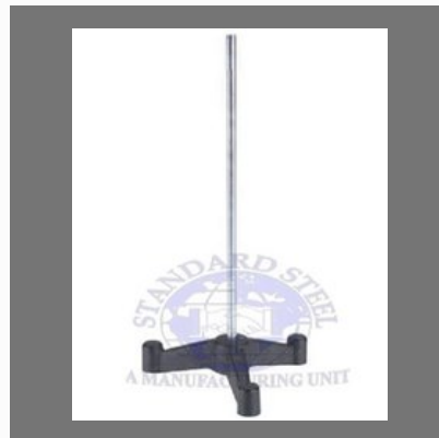
Laboratory Tripod Retort Stand