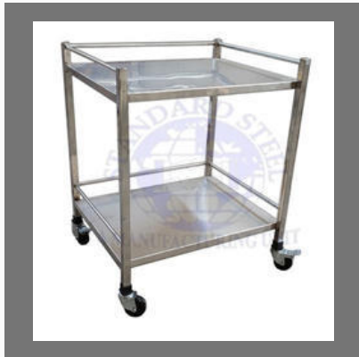
Hospital SS Instrument Trolley