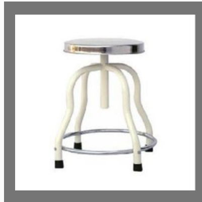
Patient Revolving Stool