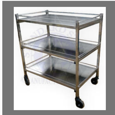
Surgical instrument Trolley