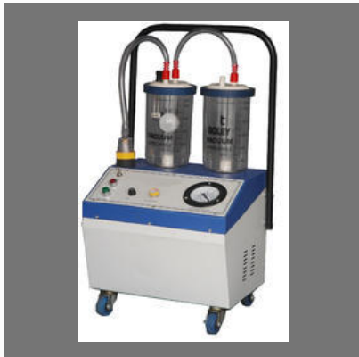
Hospital Suction Machine