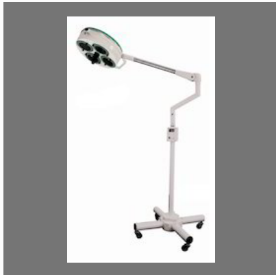
Patient Examination Light