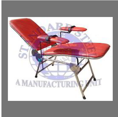
Folding Blood Donor Chair