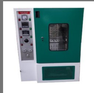
Plant Growth Chamber