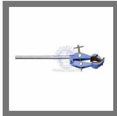
Laboratory Four Finger Clamp