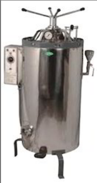
Standard Steel Double Drum Autoclave