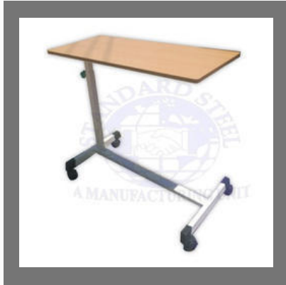
Hospital Cardiac Table