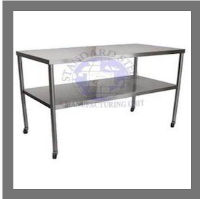
Laboratory Steel Table