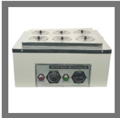
Water Bath Rectangular