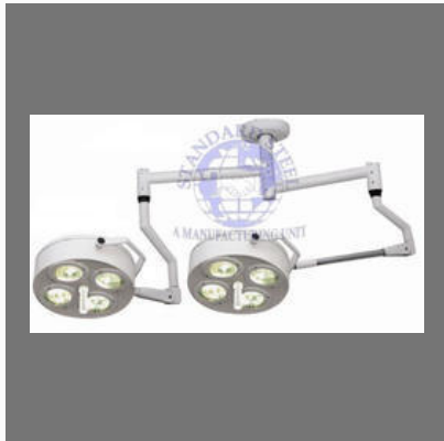
Hospital Double Dome Ceiling OT Light