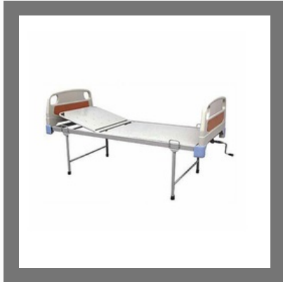
Hospital Semi Fowler Bed