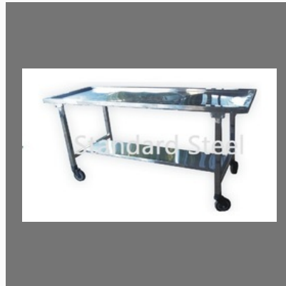
Dead Body Transfer Trolley