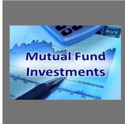
Mutual Fund(Birla Sunlife)