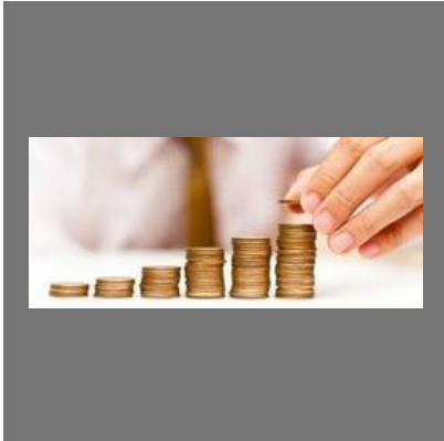
Mutual Fund Service (UTI)