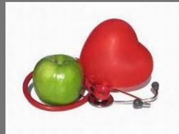
Cumulative Bonus Accident Insurance