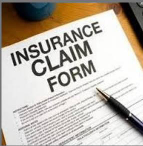
Claims Processing Solutions