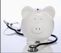
Medical Expense Extension Accident Insurance