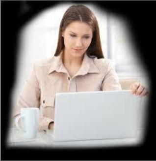
Sales Manager Portal Insurance Service