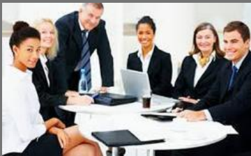
Corporate Agents Insurance Service