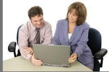
Broker Portal Insurance Service