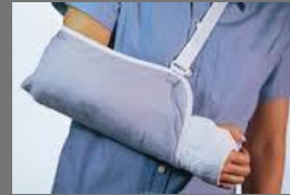
Accident Care Benefits Accident Insurance