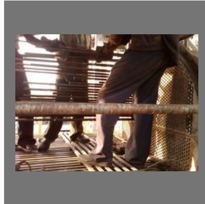
Retubing Of Heat Exchanger