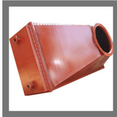
Air Pre Heater