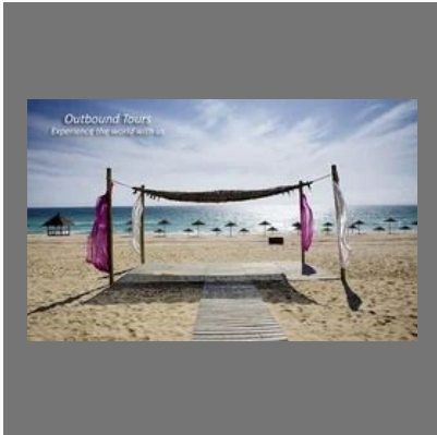
Outbound Tour Services