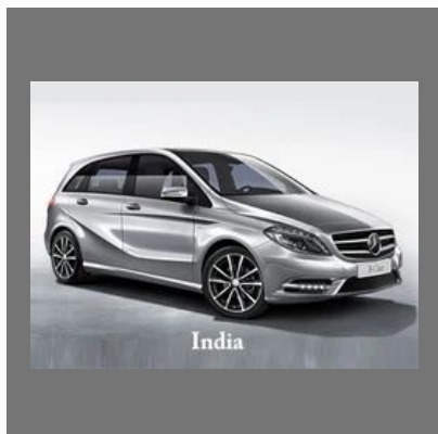
Car Rental Services