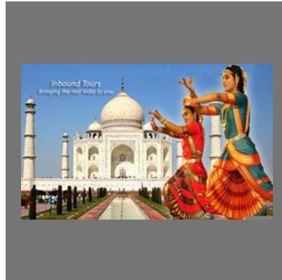
Inbound Tour Services