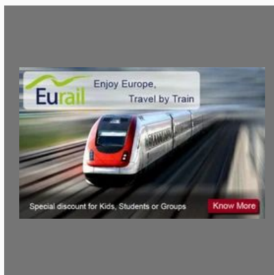
Railway Ticket Booking Services