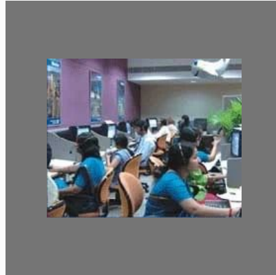
Student & Youth Travel Division