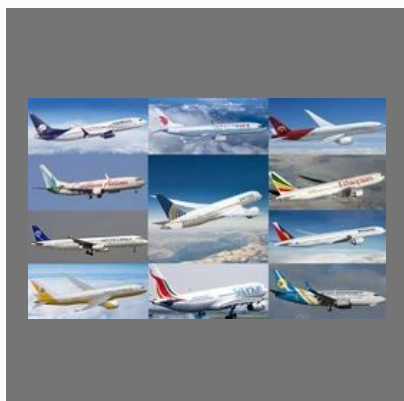
Air Ticket Booking Services