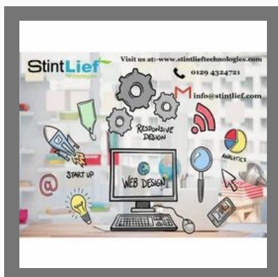
Logo Design Service