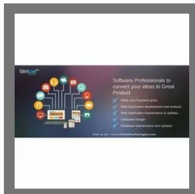
Website Development Services