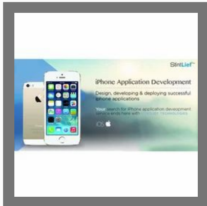
iPhone App Development Service