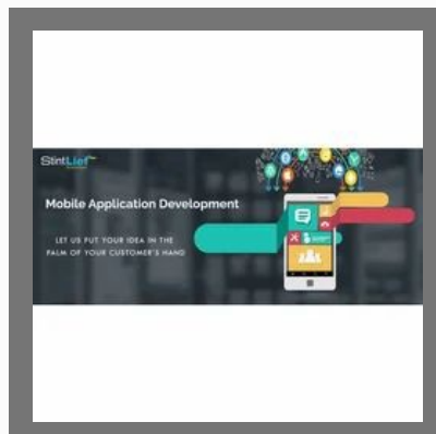
Mobile App Development Services