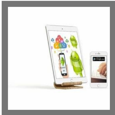
Business Mobile App Development Service