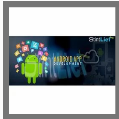
App Development Services