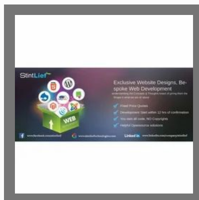
Web Designing Services