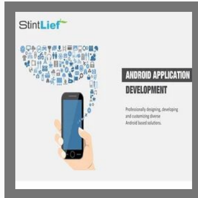
Android App Development Services