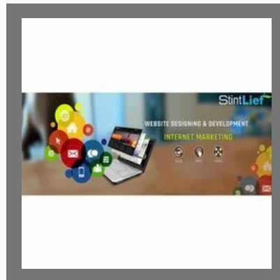
Strategic Internet Marketing Service