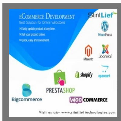
E-Commerce Development Services