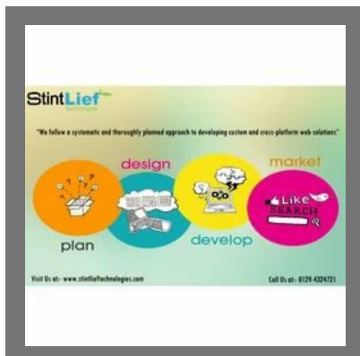
E Shop Development Service