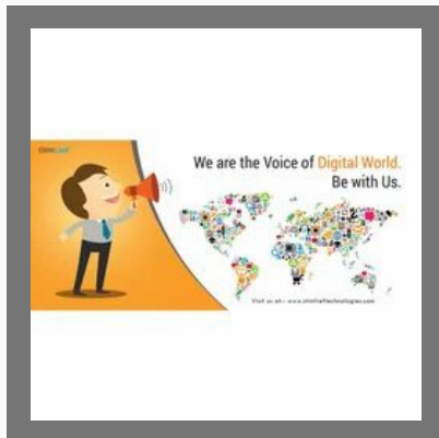
Digital Marketing Services