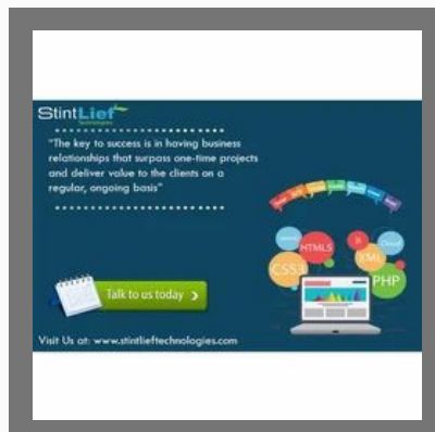
E Commerce Web Design Services