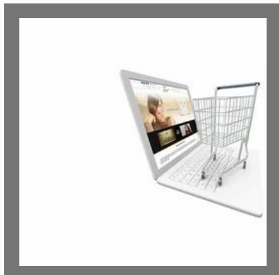
E-Commerce Optimisation Service