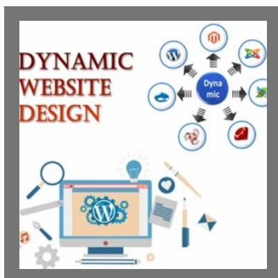
Dynamic Website Development Service