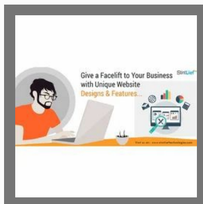
Web Application Development Service