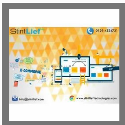
E-Commerce Application Development