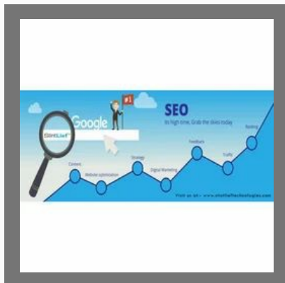
Internet Digital Marketing Service