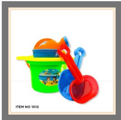
Kids Beach Set Toy - 1012