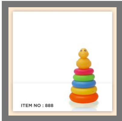
Stacking Rings Kids Toys - 888