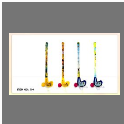
Kids Hockey Set Toy - 104