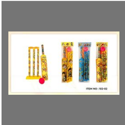
Kids Plastic Cricket Bat Ball Set - 102-02