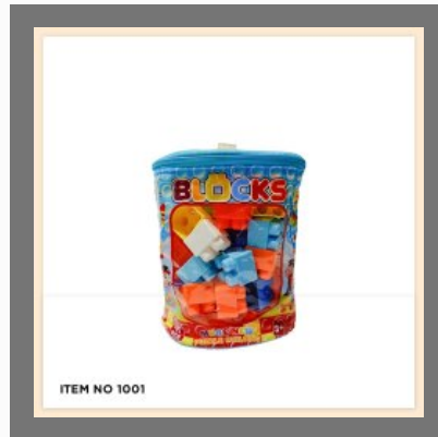
Kids Building Blocks Plastic Toys - 1001