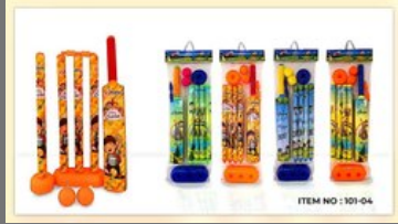
Kids Plastic Bat And Ball Set With Stumps - 101-04