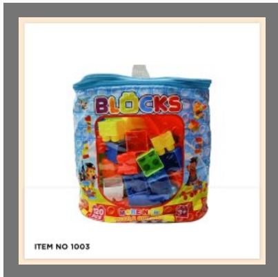
Kids Building Blocks Plastic Toys - 1003