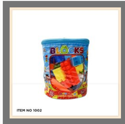
Kids Playing Building Blocks Set Toy - 1002