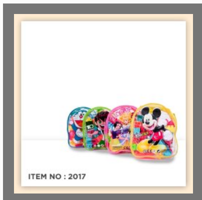
Kids Building Block Toy - 2017