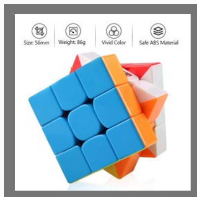
Speed Cube 3x3x3 - Made In India