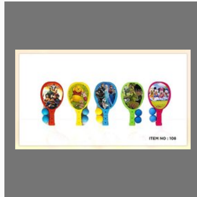
Kids Table Tennis Kit Toy - 108