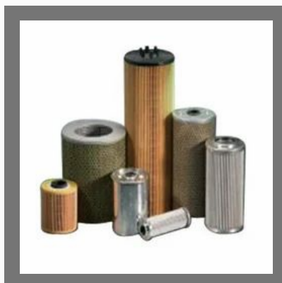
Hydraulic Oil Filters