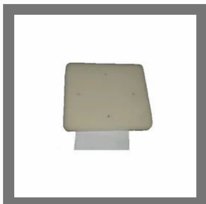
Pulsar Foam Filter