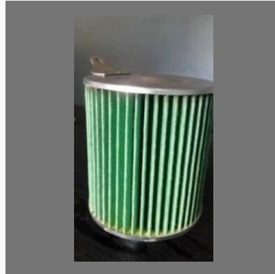
Activa New Air Filter