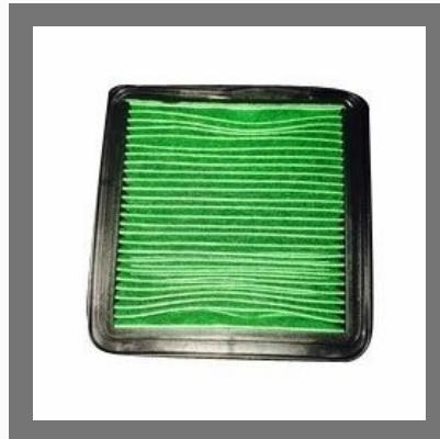
Shine Air Filter