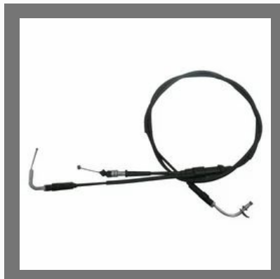
Splendor Accelerator Cable