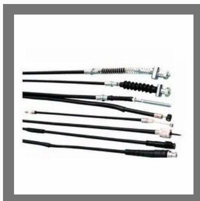
Bike Control Cable