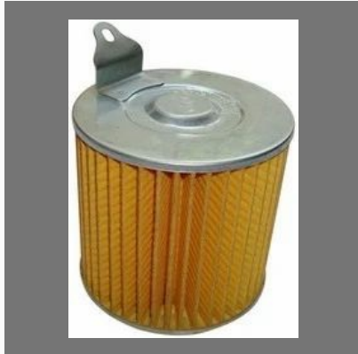
Activa Old Model Air Filter