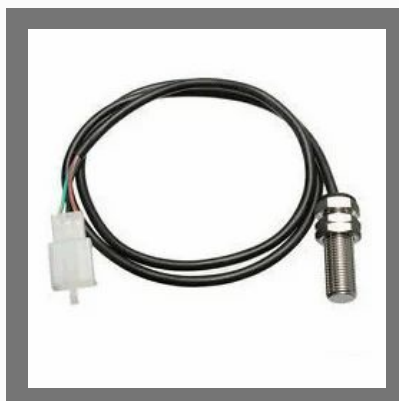
Bike Meter Cable