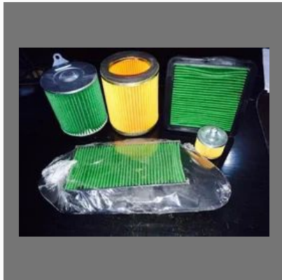
Automotive Air Filter