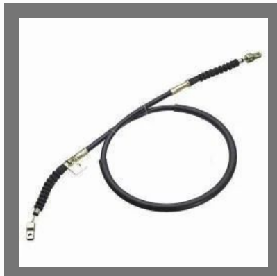
Bike Brake Cable