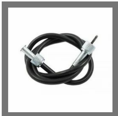
Bike Speedometer Cable