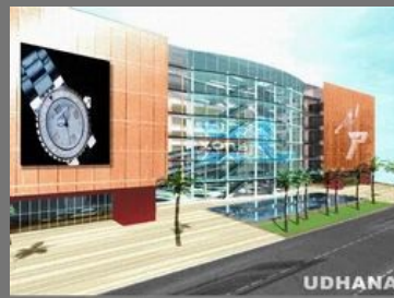
Reliance Commercial Complex - Surat