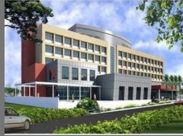
Caspia Hotel - Coimbatore