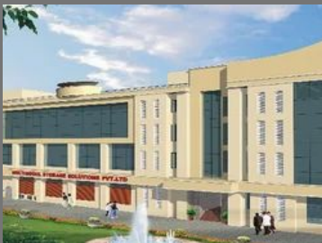
Multimodal Storage Complex - Mumbai