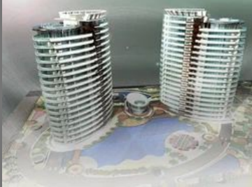
Omaxe Twin Tower - Noida