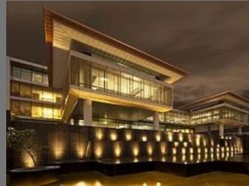
Suzlon Corporate Office