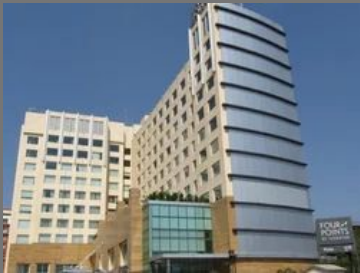
Four Points - Pune