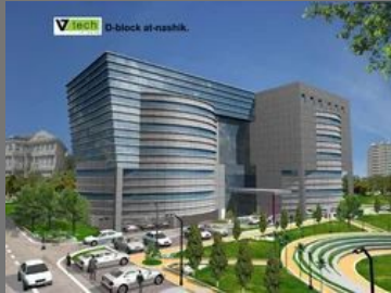
V-Tech IT Park