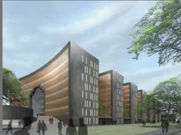
TNLA - Secretariat Building