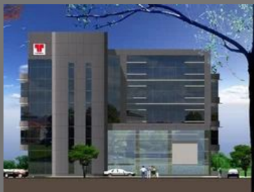
Thermax Corporate Office - Pune