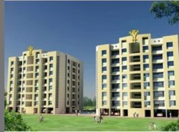
Vista - Nasik