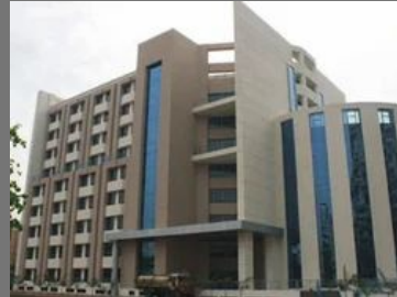
Reliance DAV School - Mumbai