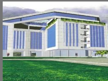
Saraswati Engg. College