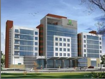
Holiday Inn - Pune