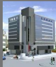
Ramee Hotel, Pune