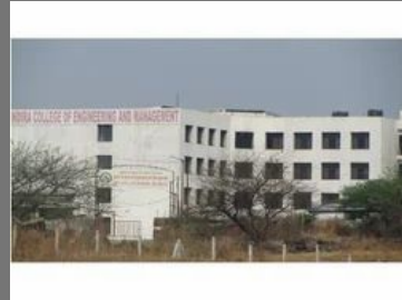
Indira College of Engineering & Management, Pune