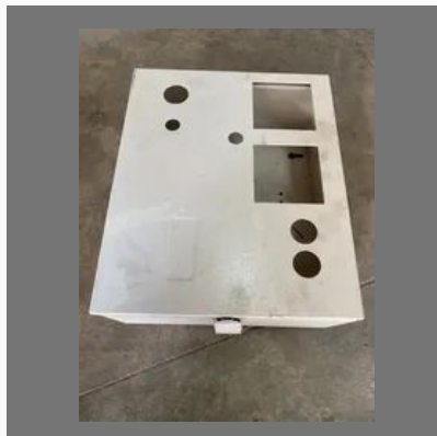
Three Phase Electric Meter Box