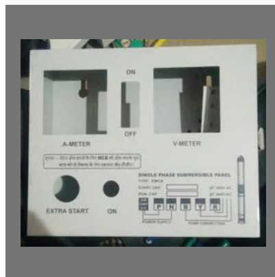
Control Panel Box