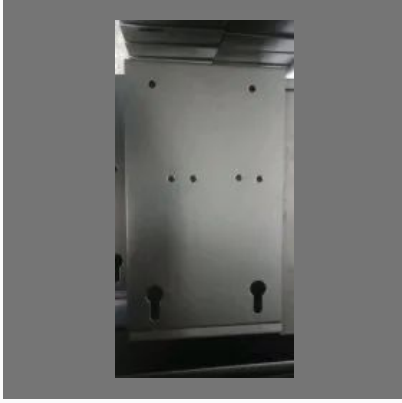
23 Matel Box