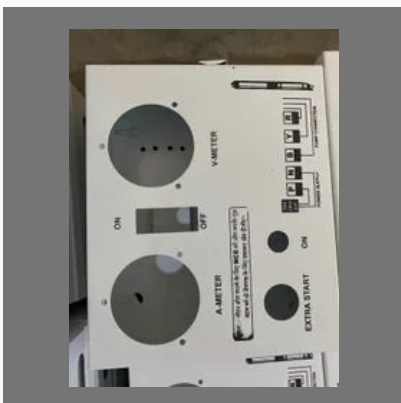
Control Panel Box