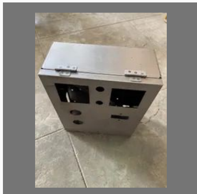
CRC Meter Box