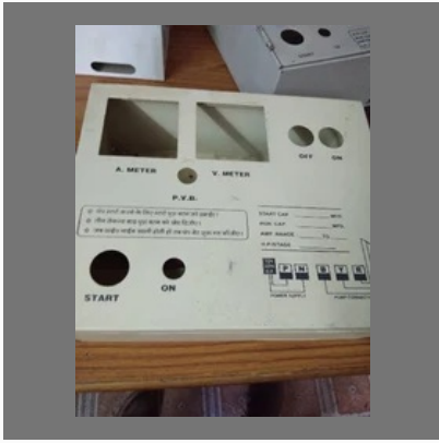
Electric Submercibal Penal Box