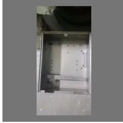
45 Matel Heavy Box