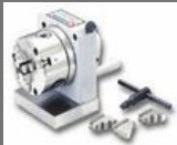
3-Jaws Punch Former, V-PS- 80J