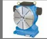
Super Hydraulic Feed