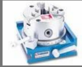
Economical Type Rapid Milling Machine Accessories