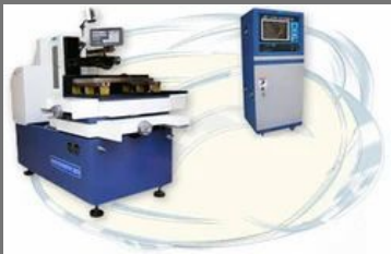
EDM Wire Cut Machines