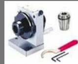
ER Collet Dividing Punch Former