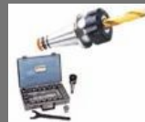
Collect Chuck Kit