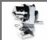
3-Jaws Punch Forme