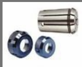
Milling Clamping Nuts & Wrench For OZ,