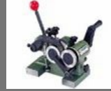
Punch Grinder Standard