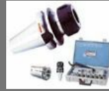
OZ-25 Collet Holder