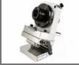
ER Collet Dividing Punch Grinder With Sine Plate,