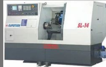
CNC Turning Centers