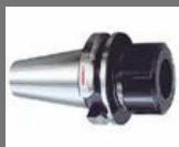
Collet Holders With BT