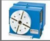
NC Rotary Table