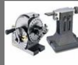
Semi-Universal Dividing Head