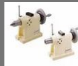
Tailstock For NC Rotary Table