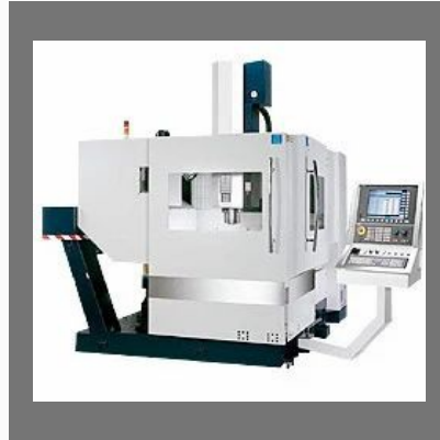
CNC Milling Centers