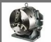
Simple Indexing Spacer