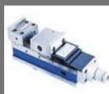
Mechanical Power Vise