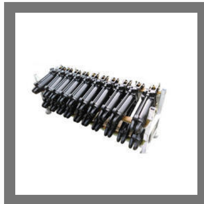
Hydraulic Cylinder for Agricultural Machinery