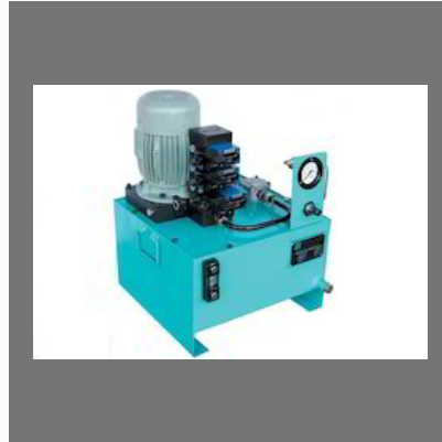
Hydraulic Power Packs