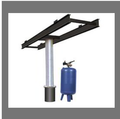
Hydraulic Cylinder for Service Station Equipments