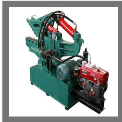
Hydraulic Cylinders for Shearing Machine