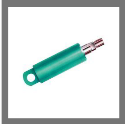
Hydraulic Cylinders Welded Construction