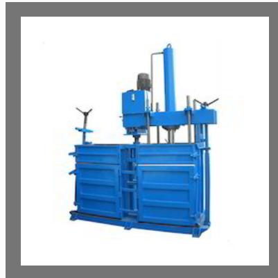
Hydraulic Power Pack for Textile Machinery