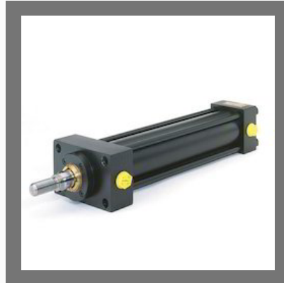
Hydraulic Cylinders Tie Rod Construction