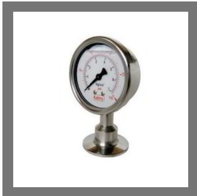
Kains Pressure Gauges