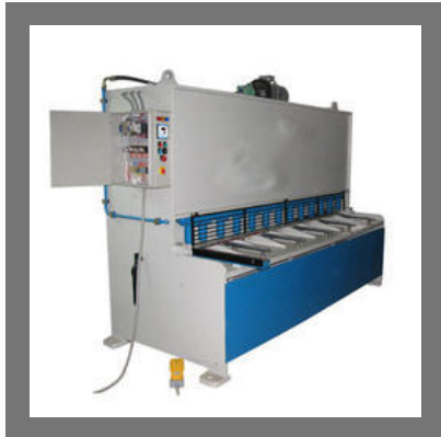
Hydraulic Power Pack for Shearing Machine