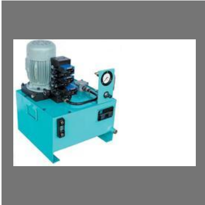
Hydraulic Power Pack