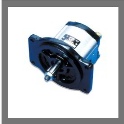
Hydraulic Gear Pumps