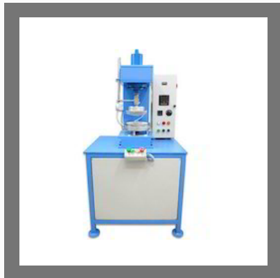
Hydraulic Power Pack for Paper Machinery