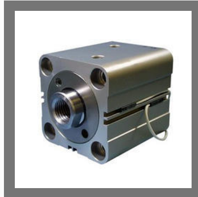
Hydraulic Compact Cylinders