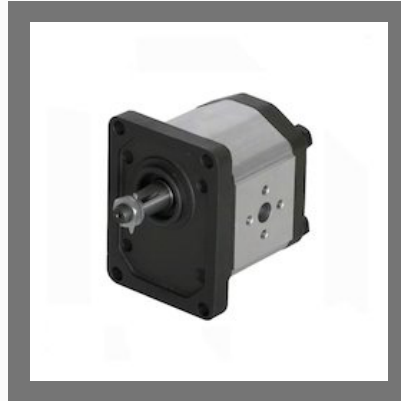
Bosch Rexroth Gear Pumps