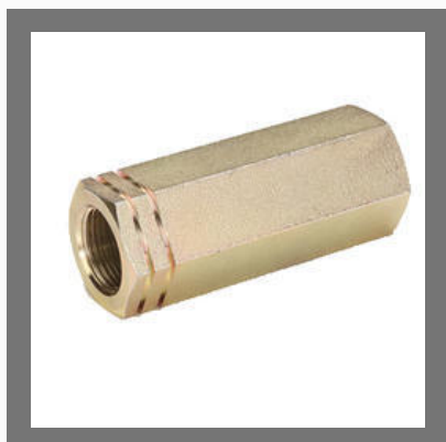
Hydraulic Check Valve / Non Return Valve