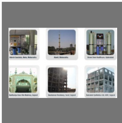
RO Live Projects