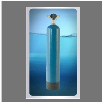
Water Soft NO R