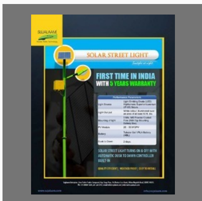
Solar Street Light