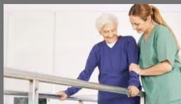
Rehabilitative Care Services