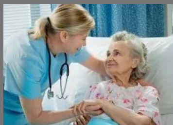
Palliative Care Services