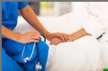
Managed Home Care Services