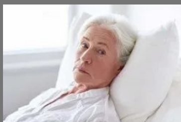
End Of Life Care Services