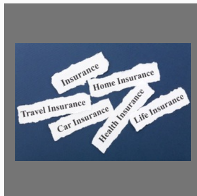
All Types Of Insurance