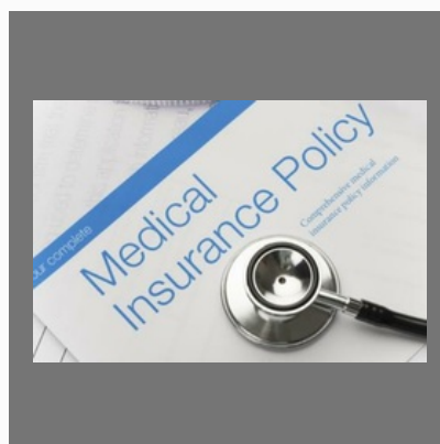
Medical Insurance Policy