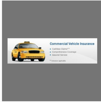
Commercial Vehicle Insurance