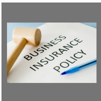
Business Insurance Policy