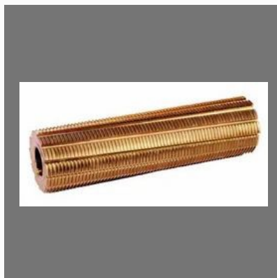
Hacksaw Blade Cutter