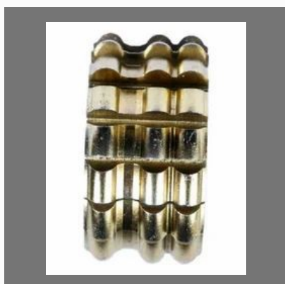
Profile Milling Cutter