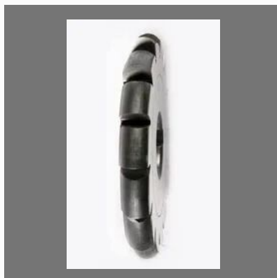
Convex Milling Cutter