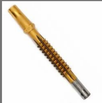
Worm Wheel Hob Cutter