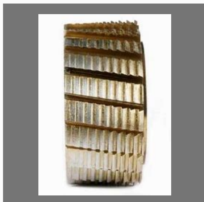
Bandsaw Blade Cutter