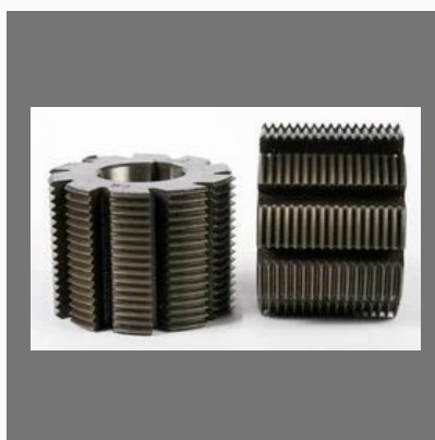
Serration Hob Cutter