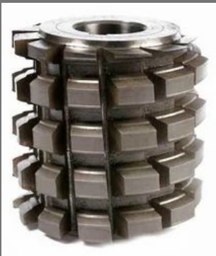
Spline Hob Cutter