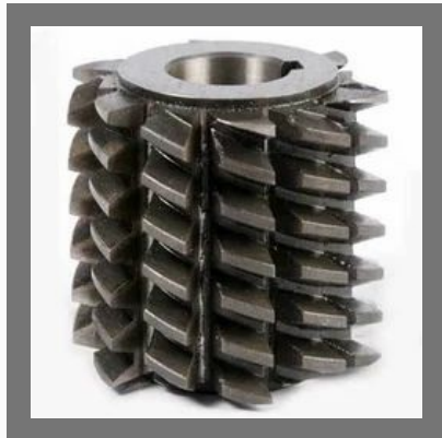
Gear Hob Cutter