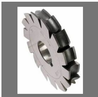
Concave Milling Cutter