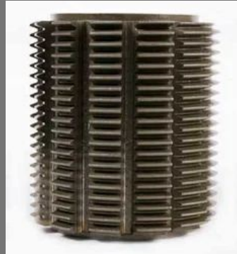
Gear Hob Cutter