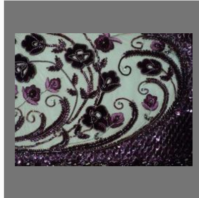
Bridal Embroidery Creation