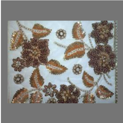
Haute Couture Embroidery Creation