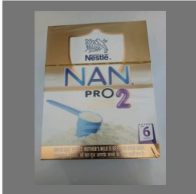
Nestle Nan Pro2