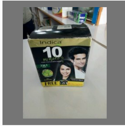
Indica Hair Colour