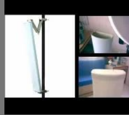
Sector Antenna Enclosure