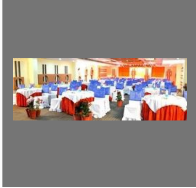
Victory Banquet Hall