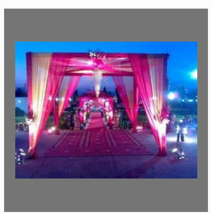
Sunrise Wedding Planing