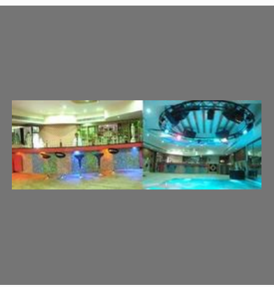
Bar (Club Boom Town)