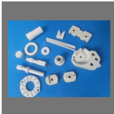
High Alumina Ceramic Products