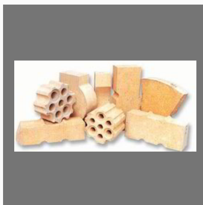
Refractories Ceramic Bricks