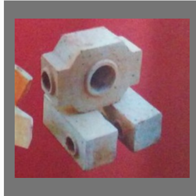
Bottom Pouring Sets