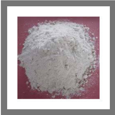
Basic Ramming Mass