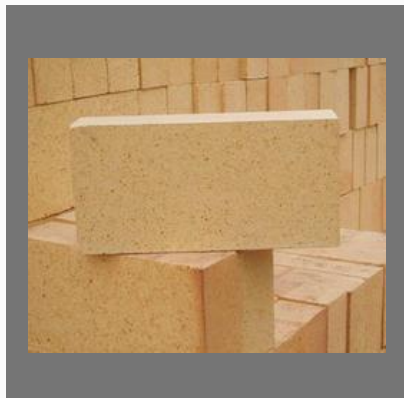
High Alumina Bricks