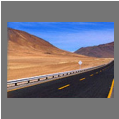
Airport Runway Project