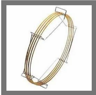
BP-1 : 100% Dimethyl Polysiloxane - 054050