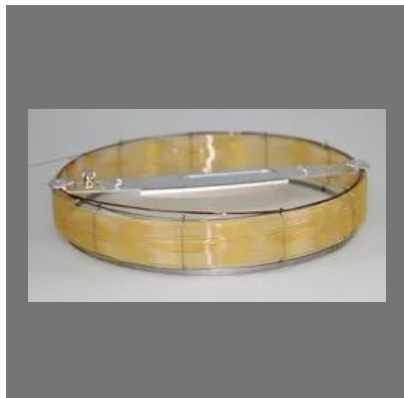
BPX-90 : 90% Cyanopropyl Polysilphenylene-Siloxane - 054580