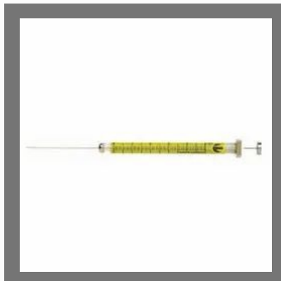
LC Autosampler Syringes - 005330