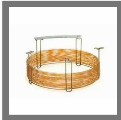
BP-20 (WAX) : Polyethylene Glycol - 054442