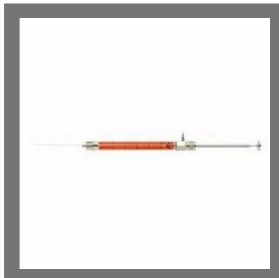
LC Autosampler Syringes - 004810