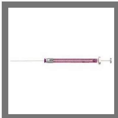
GC Autosampler Syringes - CTC Analytics - 003700