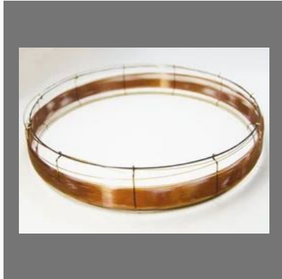
BPX-5 : 5% Phenyl Polysilphenylene-Siloxane - 0541261