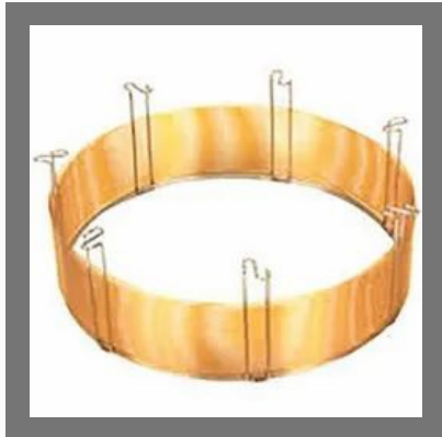
BP-1 : 100% Dimethyl Polysiloxane - 054807