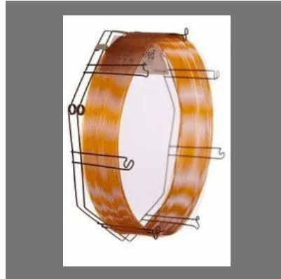
Bpx-5 : 5% Phenyl Polysilphenylene-Siloxane - 054099