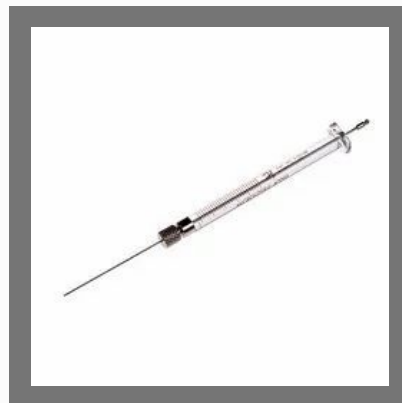
General Purpose Manual Syringes 0.5 - 5 Nanovolume - 000310