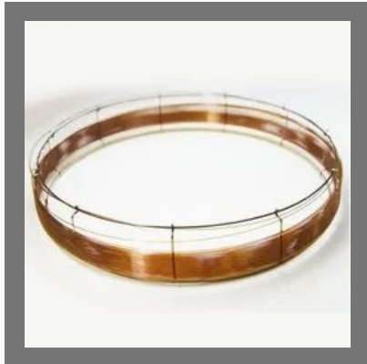
BP-20 (WAX) : Polyethylene Glycol - 054436