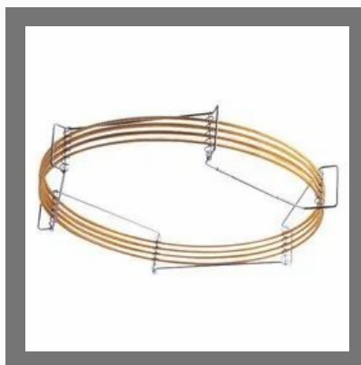
BP-20 (WAX) : Polyethylene Glycol - 054448