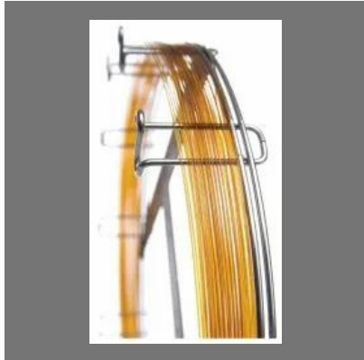
Bpx-70 : 70% Cyanopropyl Polysilphenylene-Siloxane - 054624