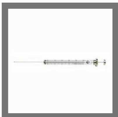
LC Autosampler Syringes - 005715