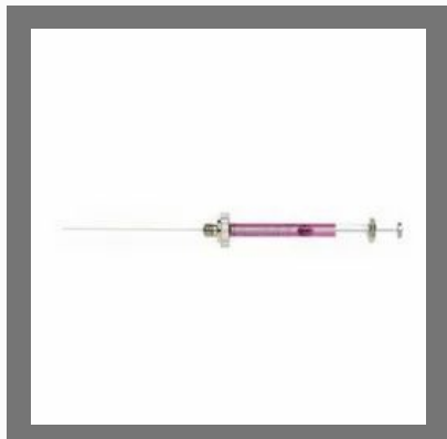
LC Autosampler Syringes - 006330