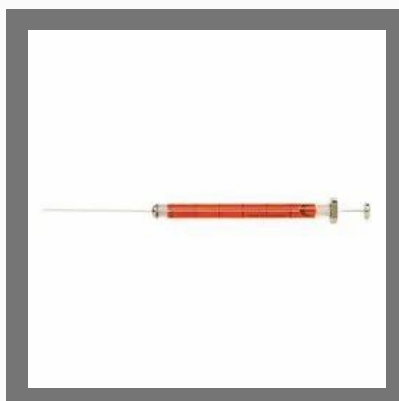
LC Autosampler Syringes - 002710