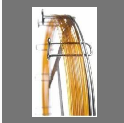
Bpx-70 : 70% Cyanopropyl Polysilphenylene-Siloxane - 054622