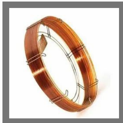
BPX-608 : 35% Phenyl Polysilphenylene-Siloxane - 054823