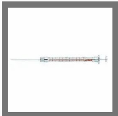
GC Autosampler Syringes - 001981