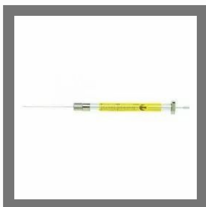
GC Autosampler Syringes - CTC Analytics - 002977