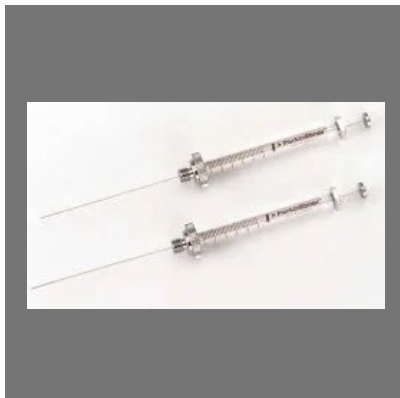
GC Autosampler Syringes - PerkinElmer Instruments - 001954