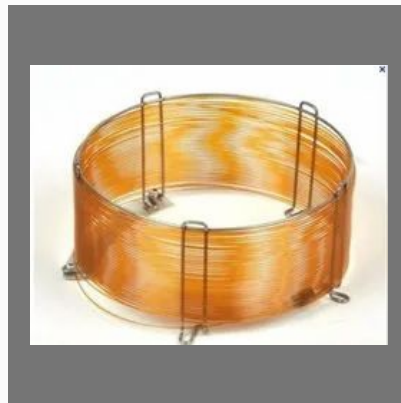
BPX-5 : 5% Phenyl Polysilphenylene-Siloxane - 054118