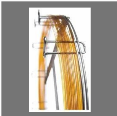
Bpx-70 : 70% Cyanopropyl Polysilphenylene-Siloxane - 054607