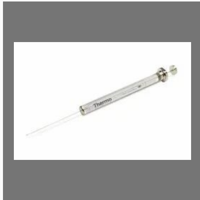
General Purpose Manual Syringes 0.5 - 5 NanoVolume - 000300