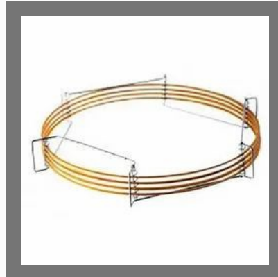
BP-1 : 100% Dimethyl Polysiloxane - 054812