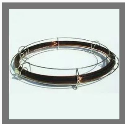
BPX-5 : 5% Phenyl Polysilphenylene-Siloxane - 054133