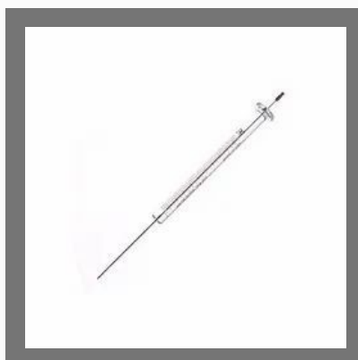
GC Autosampler Syringes - CTC Analytics - 001982