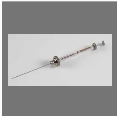
GC Autosampler Syringes - PerkinElmer Instruments - 004670