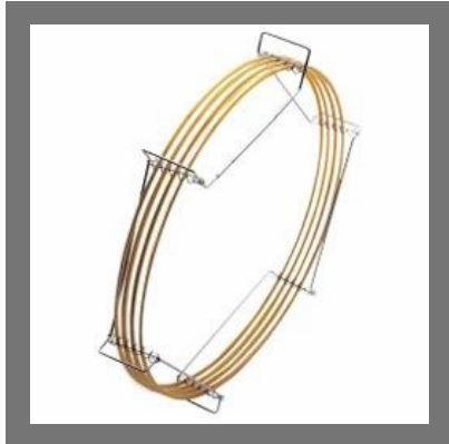
BP-20 (WAX) : Polyethylene Glycol Column - 054450