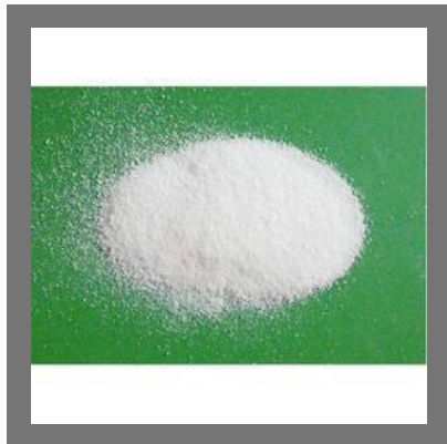
DL Methionine BP (Pharma Grade)