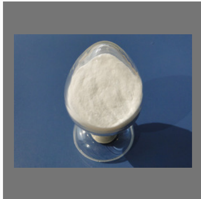
L Glutamic Acid BP (Pharma Grade)