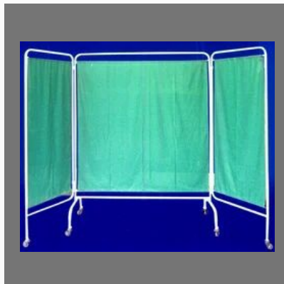
Bed Side Screen