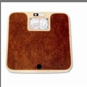
Krupps Weight Machine