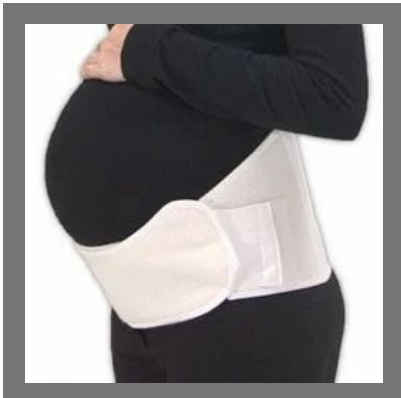
Pregnancy Back Support