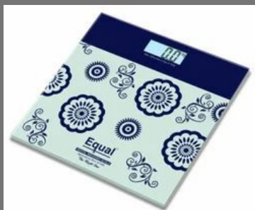
Digital Weighing Scale