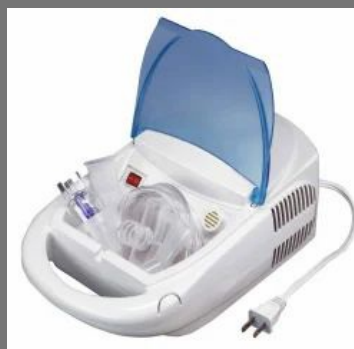
Nebulizer Medical Machine