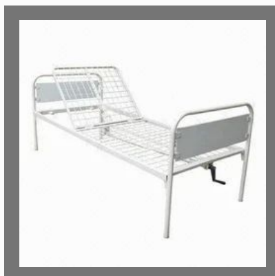
Adjustable Hospital Bed