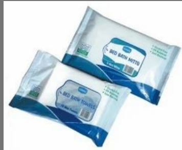
Bed Bath Towels