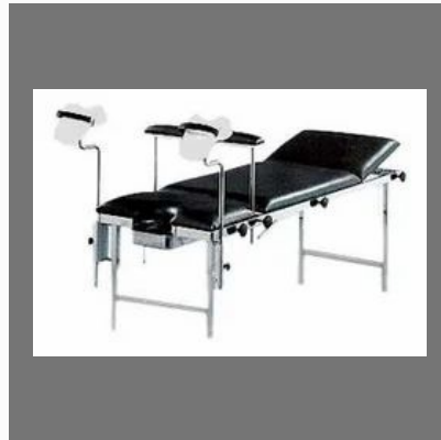
Medical Examination Table