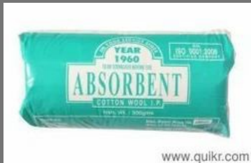
Absorbent Cotton 400grms