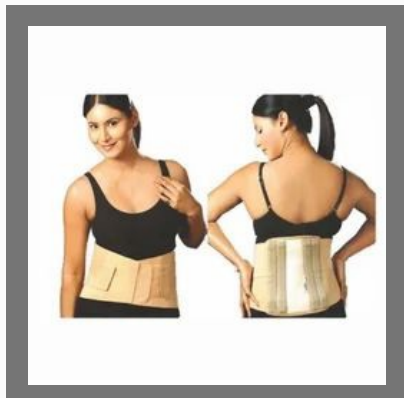
Back Support Belts