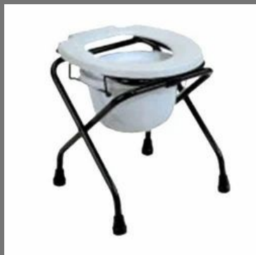
Commode Stool Folding