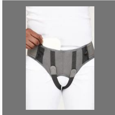
Hernia Abdominal Belt