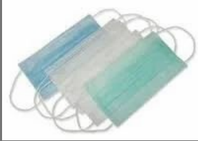
Face Mask 100s Box