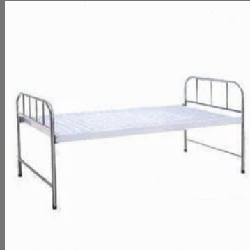
Hospital Bed Regular