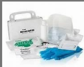
First Aid Medical Kit