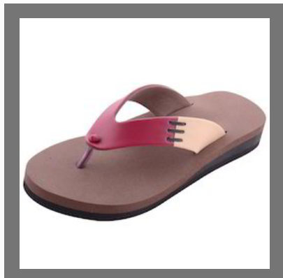
Mcr Chappals Ladies