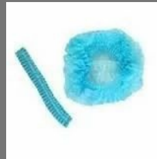
Disposable Bouffant Cap