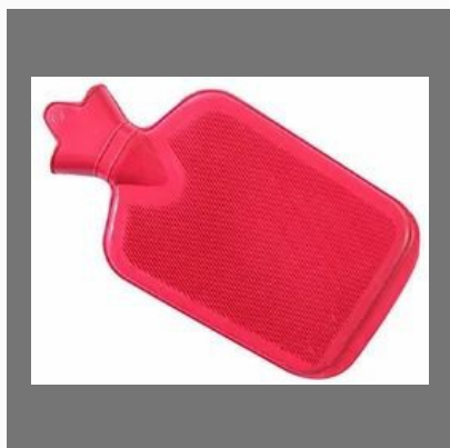
Hot Water Bag Deluxe