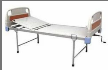
Hospital Semi Fowler Bed