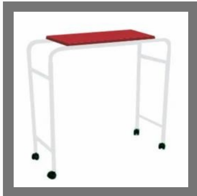
Over Bed Food Table