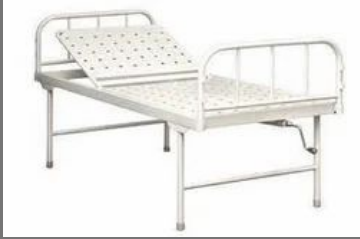
Fowler Hospital Bed Powder Coated