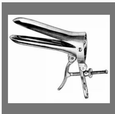
Cusco Vaginal Speculum