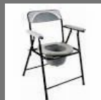
Bedside Commode Chair