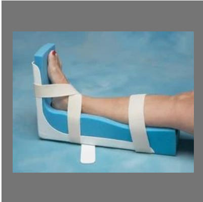
Foot Drop Splint