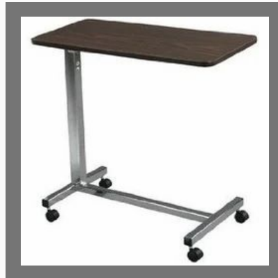
Patient Convenient Table