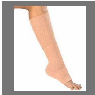
Varicose Vein Stockings