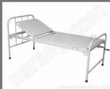
Semi - Flower Bed Economy