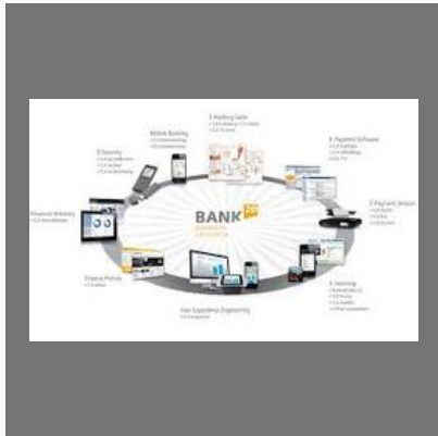
International Finance Related Service