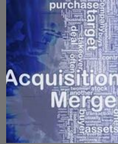
Acquisition Transaction Service