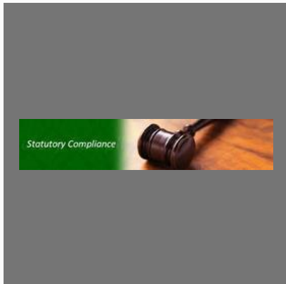
Statutory Compliance Service