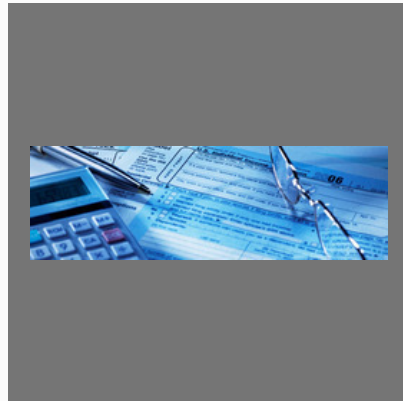
Internal Audit Service