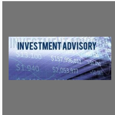
Investment Advisory Service