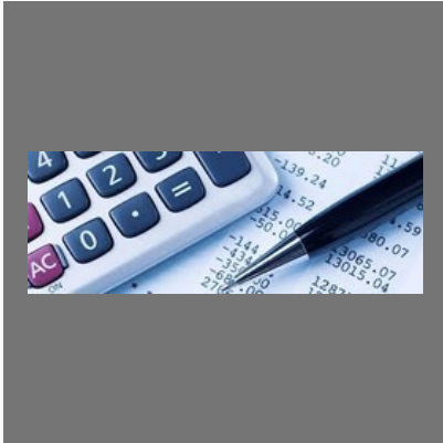
Business Valuation Service