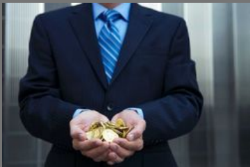
Charitable Trusts Matter Service