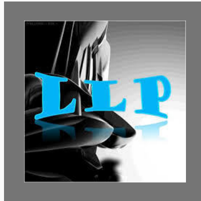
LLP Matter Service