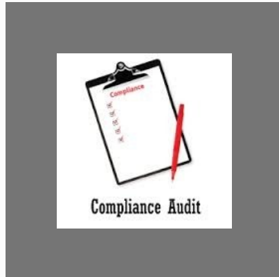
Compliance Audit Service