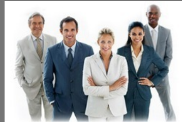
HRD Related Service