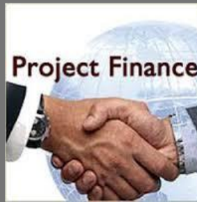
Project Financing Service