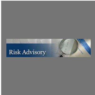
Risk Advisory Service