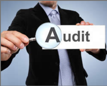
Management Audit Service