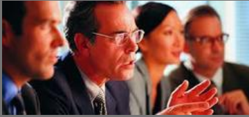
Transfer Pricing Matter Service