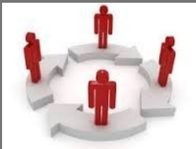
Reorganisation & Restructuring Service