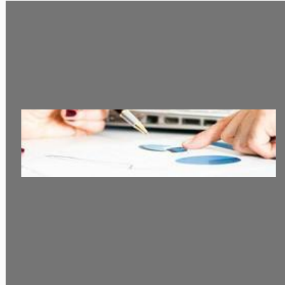
Brand Valuation Service