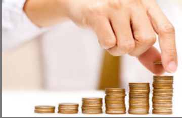
Wealth Management Service