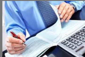
Accounting and Related Service