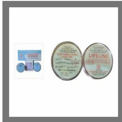
Silk Sutures .