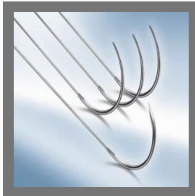
Stainless Steel Sutures