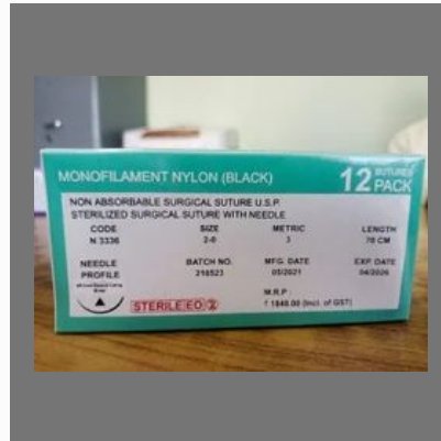
Monofilament Suture .