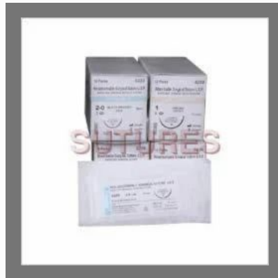
Sterile Surgical Sutures