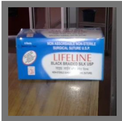
Silk Suture On Reels