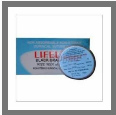
Non Absorbable Surgical Sutures Braided Silk White