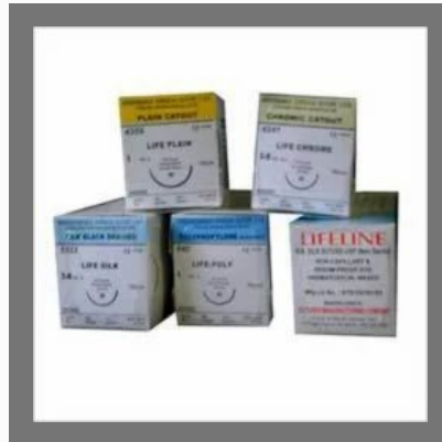
Sterilized Surgical Sutures