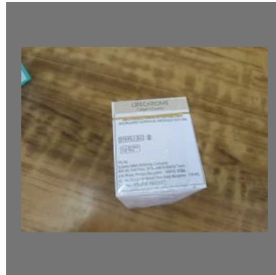
Catgut Suture .