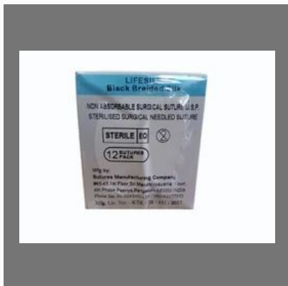
Black Braided Silk size 3-0