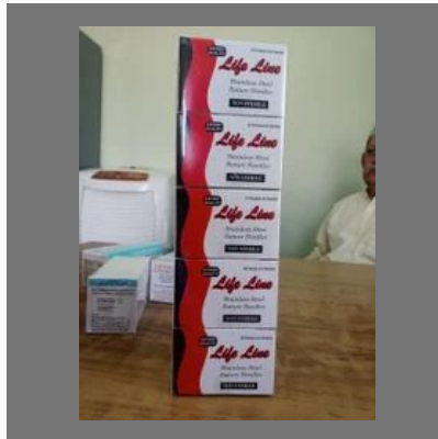
Surgical Suture Needle