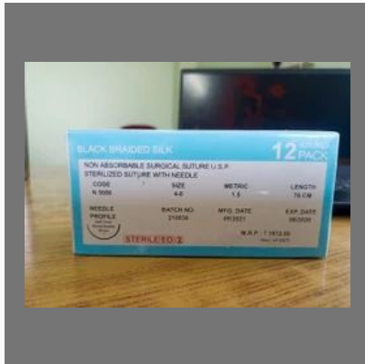
Non Absorbable Sutures