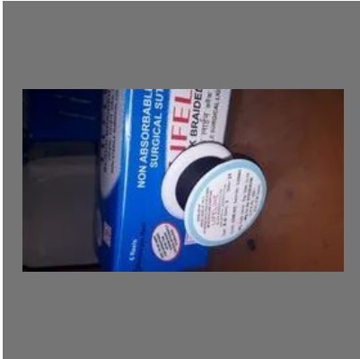
Medical Silk Suture Reels