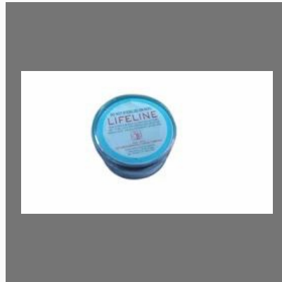
Silk Black Braided Suture