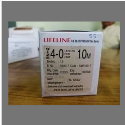
4 0 Silk Suture