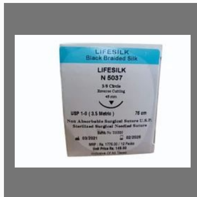
Black Braided Silk Suture