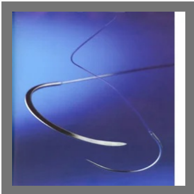
Non Absorbable Suture