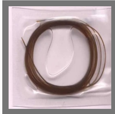
Catgut Suture .