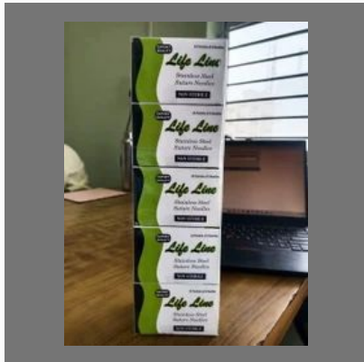
Stainless Steel Suture Needle