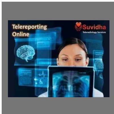
Tele Radio Services