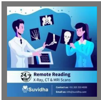
Online X Ray Reporting