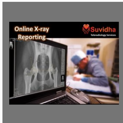
Teleradio ( Online X-Ray Reporting Service )