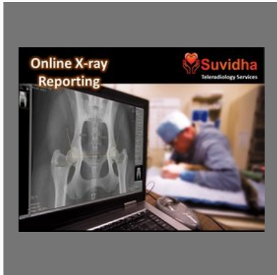
Online X Ray Reporting