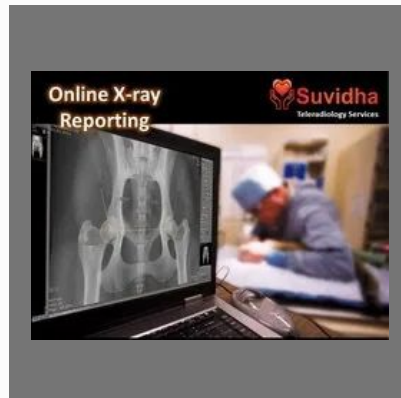
Teleradio ( Online X-Ray Reporting Service )