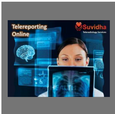
Tele Radio Services