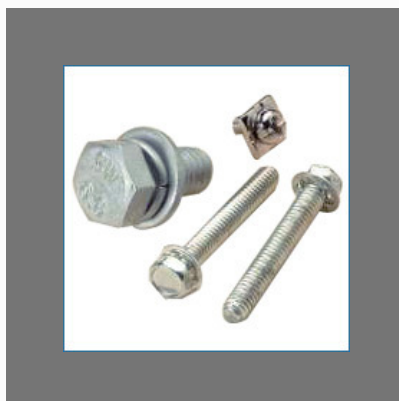
Socket Set Screws