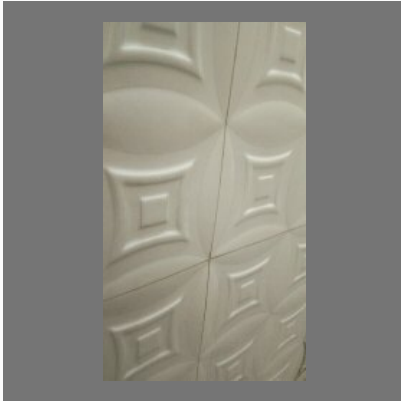
Potash Iodide Powder