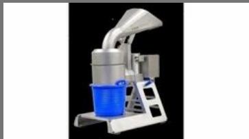
Potato Chips Slicer