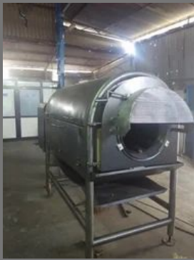
Potato Chips machinery Continuous Peeler