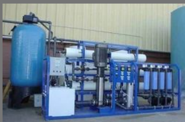
Water Treatment Plant