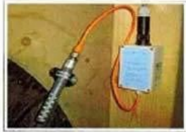
Carbon Dioxide Sensor