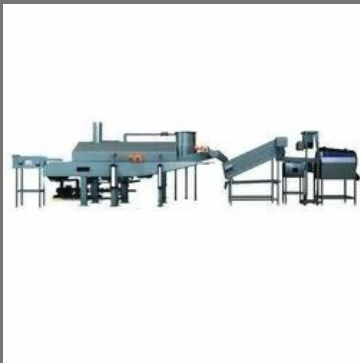
Potato Chips Lines