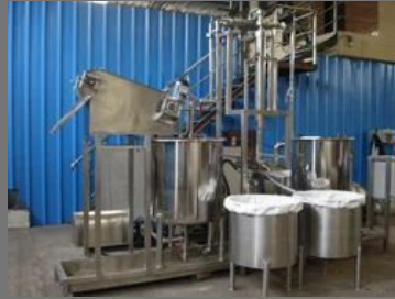
Starch Recovery Machines