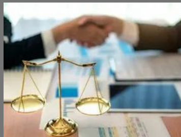
LLP Registration Service