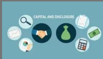
SEBI Laws & Regulations