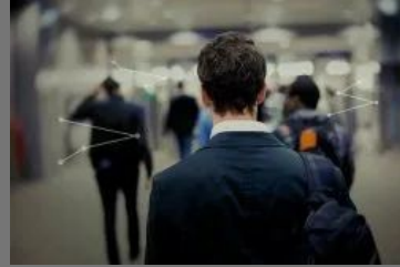
Representation Before Authorities