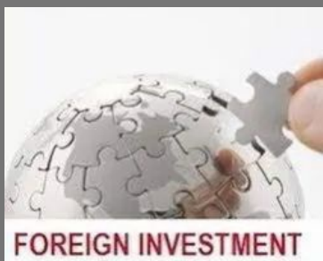
Foreign Investment Consultant