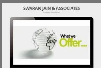
Debt Equity Syndication Along With Project Financing