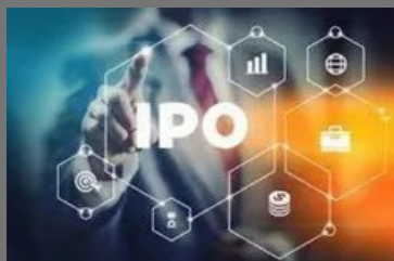
IPO Advisory Services