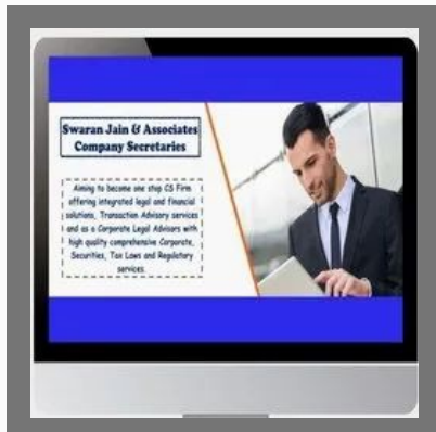
Foreign Exchange Services Under Reserve Bank Of India