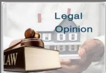
Legal Opinion Service