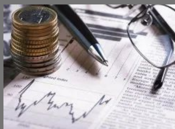
Valuation Services Financial Assets