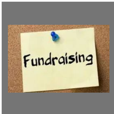
Fund Raising Services