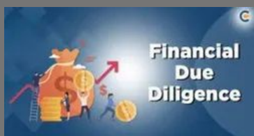
Financial Due Diligence