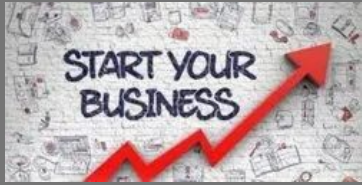
Business Startup Service