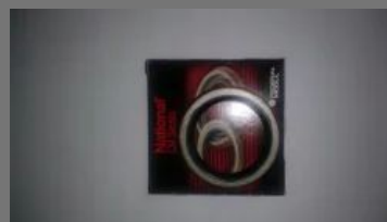
Rubber Oil Seals