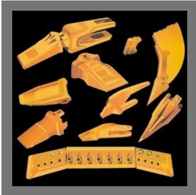
Earth Moving Equipments Spares