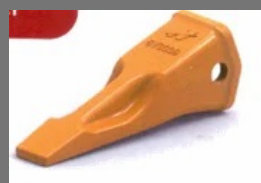
Ripper - Earth Moving Equipment's Spares