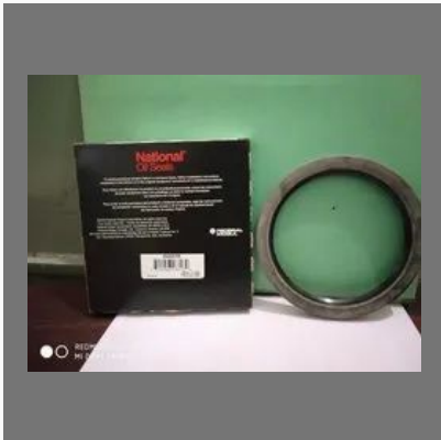
NATIONAL OIL SEAL 455070