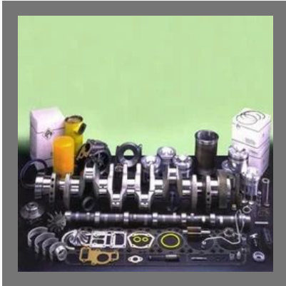
Diesel Engine Spares