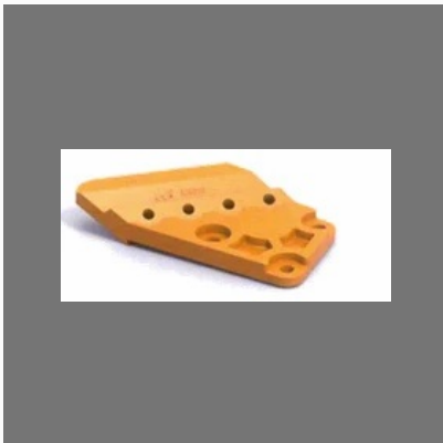
Side Cutter - Earth Moving Equipments Spares