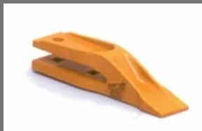
Fork Tooth - Earth Moving Equipments Spares