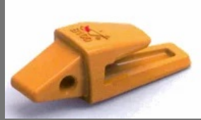
Adapter - Earth Moving Equipments Spares