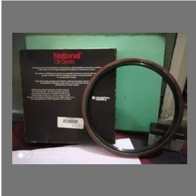
NATIONAL OIL SEAL 415867