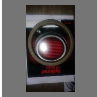
Rubber Oil Seals