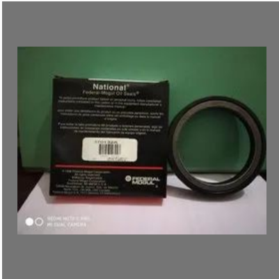
National Oil Seal 370132a