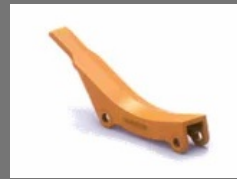
Protector - Earth Moving Equipments Spares