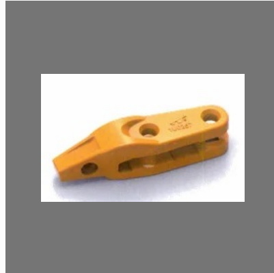
Adapter - Earth Moving Equipments Spares