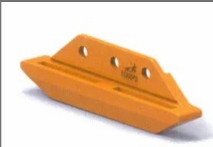
Side Cutter - Earth Moving Equipments Spares