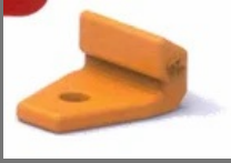
Protector - Earth Moving Equipments Spares