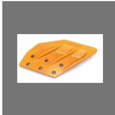
Side Cutter - Earth Moving Equipments Spares