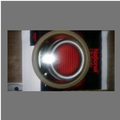
Rubber Oil Seals