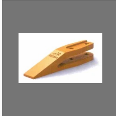
Fork Tooth - Earth Moving Equipments Spares