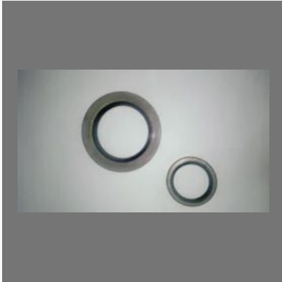
Rubber Oil Seals