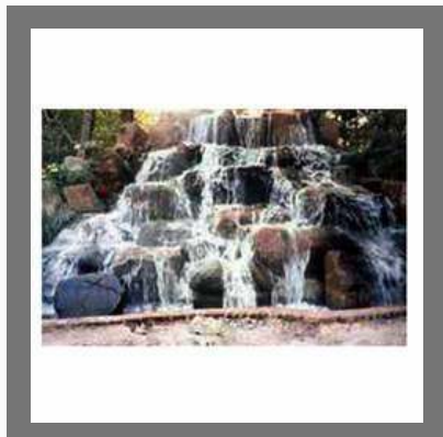
Zen Garden Waterfalls