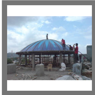
Garden Fiber Dome