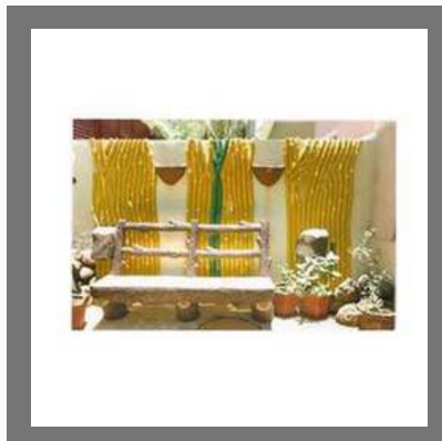
Reinforced Concrete Bamboo