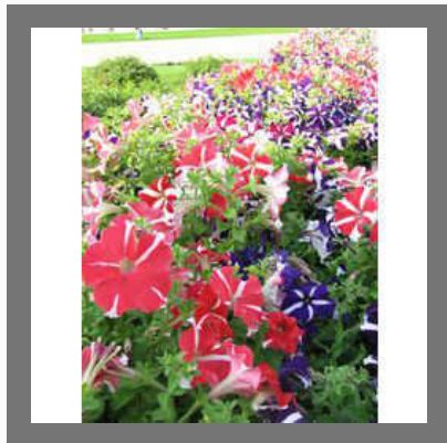
Garden Decor Flower Bed