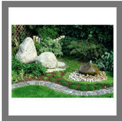
Rock Garden Designing Service