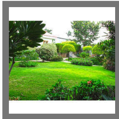
Landscape Development Services