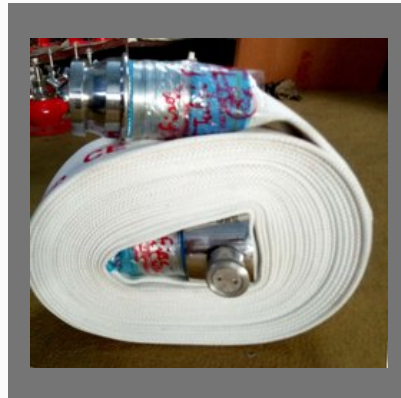
RRL Hose Pipe