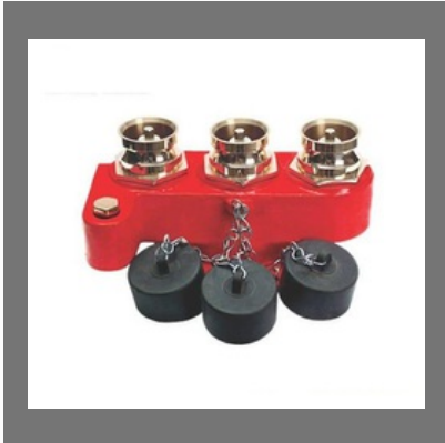
Three Way Fire Inlet Bridge