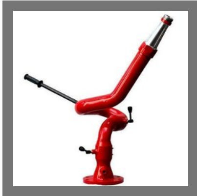
Fire Water Monitor