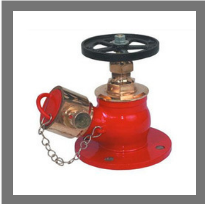
Single Headed Hydrant Valve