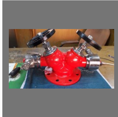
Double Headed Hydrant Valve