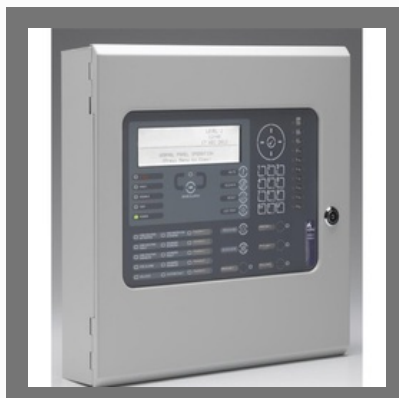
Addressable Fire Alarm Panel