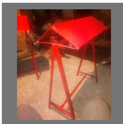
Fire Bucket Stand