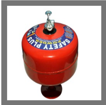
2Kg Automatic Modular Powder Type Fire Extinguisher