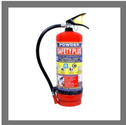
4 Kg ABC Fire Extinguisher