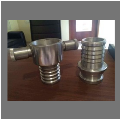
Male Female SS Coupling