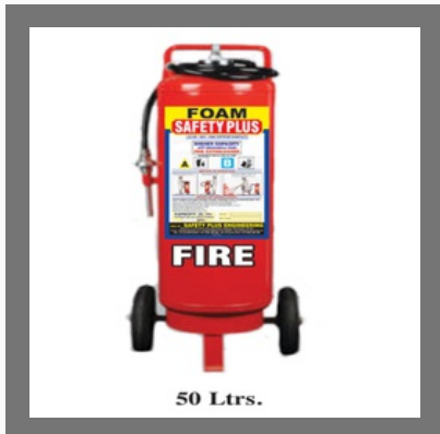
50L Foam Based Fire Extinguishers