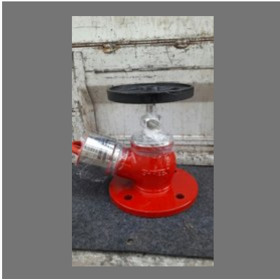
Single Headed Fire Hydrant Valve