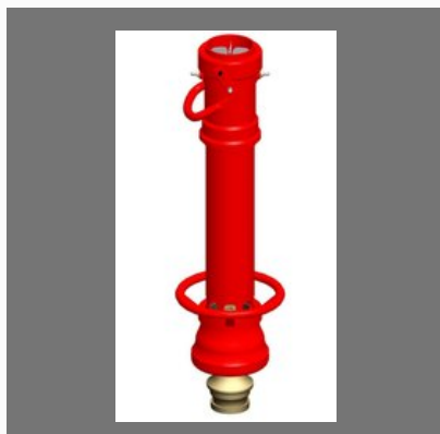
FB10X Foam Making Branch Pipe