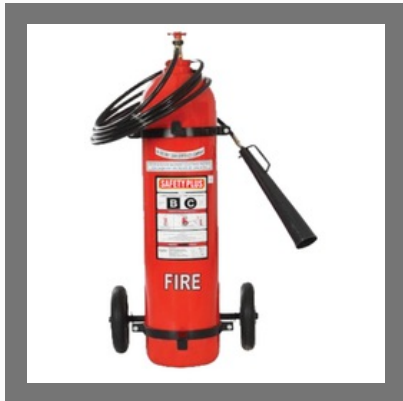
9Kg Co2 Trolley Mounted Fire Extinguishers