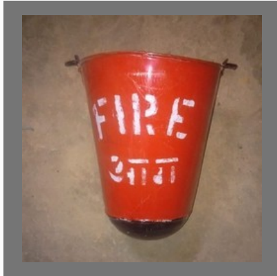
Red Fire Bucket