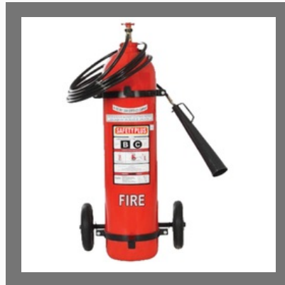
22.2Kg Co2 Trolley Mounted Fire Extinguishers