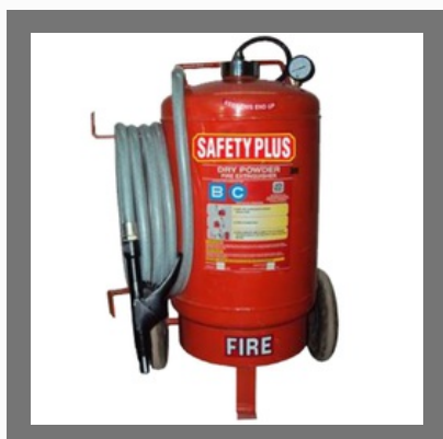
75Kg Dry Chemical Powder Fire Extinguishers