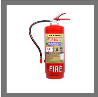
9L Cartridge Type Fire Extinguisher