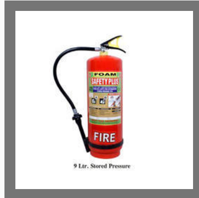
9L Stored Pressure Foam Fire Extinguisher