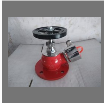
Fire Hydrant Valve