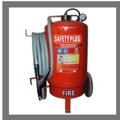
25Kg Dry Chemical Powder Fire Extinguishers