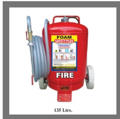
135 Ltrs Foam Based Fire Extinguisher