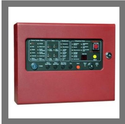
Conventional Fire Alarm Panel