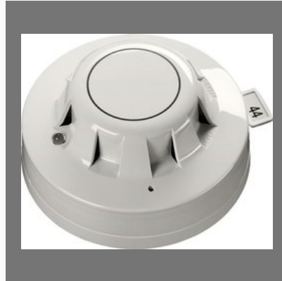
Battery Operated Smoke Detector