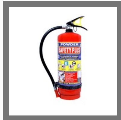
6 Kg ABC Fire Extinguisher