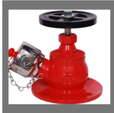
SS Single Headed Hydrant Valve