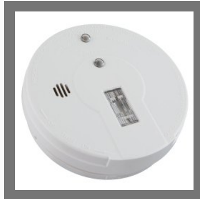
Battery Operated Smoke Detector