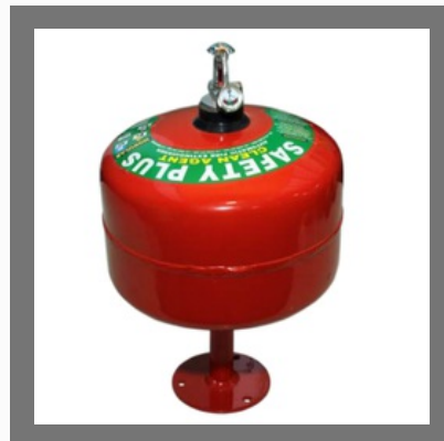
10Kg Automatic Modular Clean Agent Type Fire Extinguisher