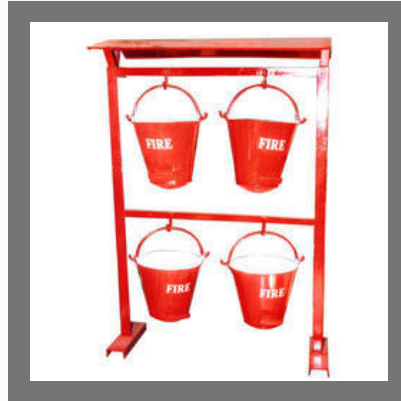
Fire Bucket Stand With Bucket