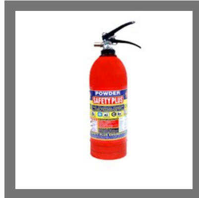
2 Kg ABC Fire Extinguisher