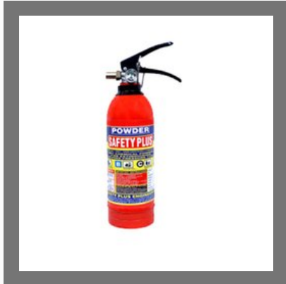
1 Kg ABC Fire Extinguisher