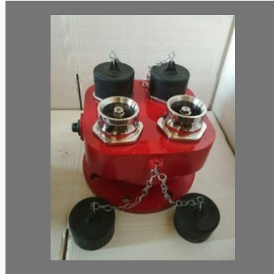
4 Way Inlet Bridge