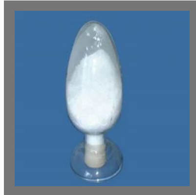
Talc For Ceramic Industry