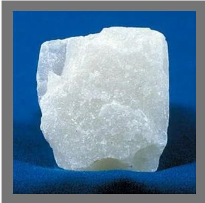
Talc For Paper Industry