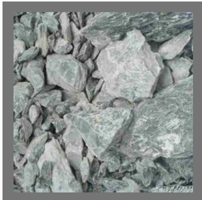
Steatite / Talc Lumps