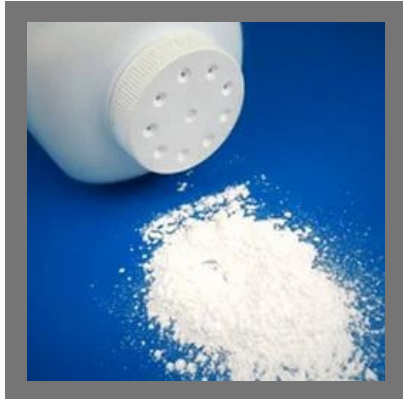
Talc For Cosmetic Industry