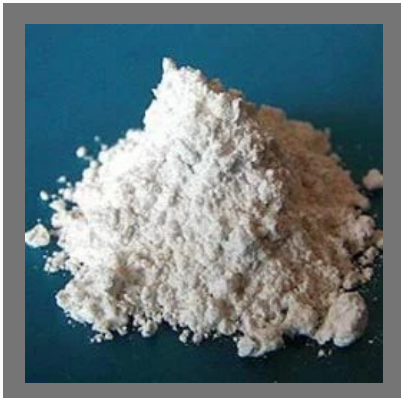
Talc For Textile Industry