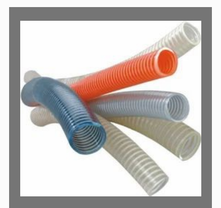
PVC Suction Hose