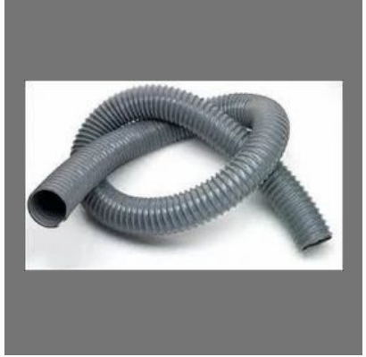
PVC Duct Pipe