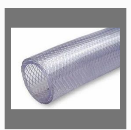
PVC Braided Hose