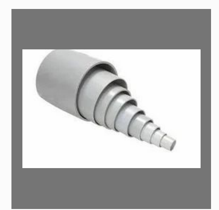
Rigid PVC Pipes