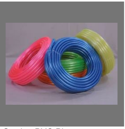
Garden PVC Pipe