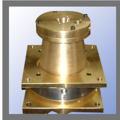
EPS Glass Mould