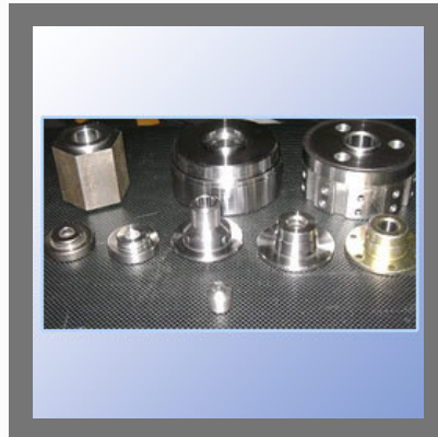
Precision Machined Components