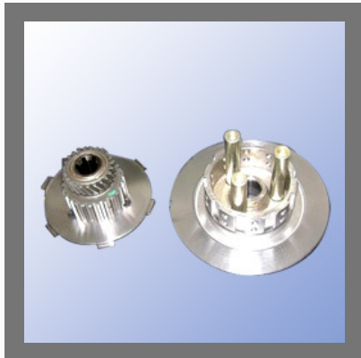
Moulding Sub Assembly