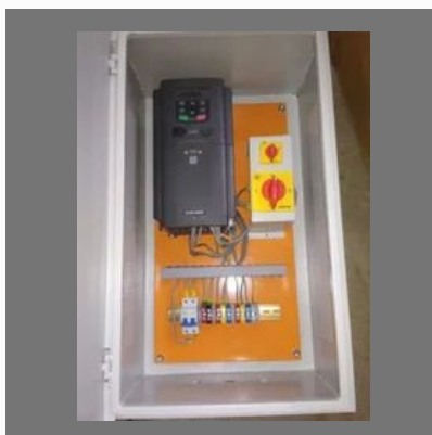
Solar Pump Controller