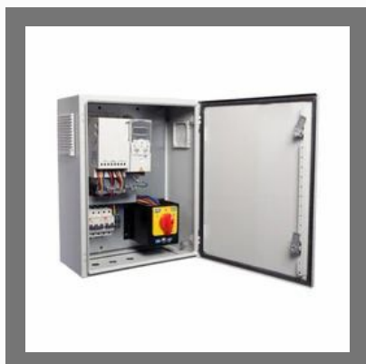
Solar Pump Controller