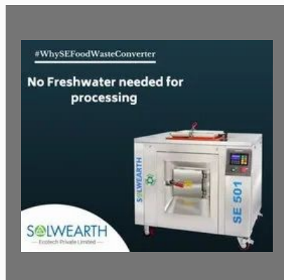
ORGANIC WASTE CONVERTER