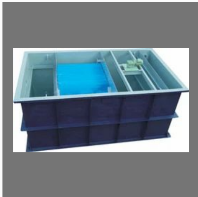
Lampak Water Treatment Plant