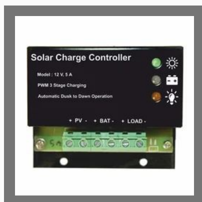
Solar Charge Controller