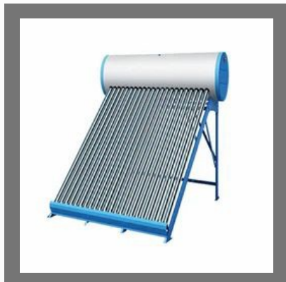
Solar Water Geyser