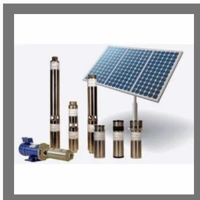
Solar Submersible Pumps