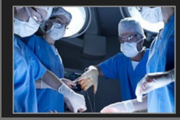
Burns Plastic And Cosmetic Surgery