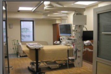
Radiology Treatments Services