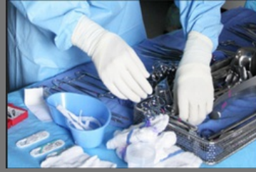
Uro Surgery And Nephrology Treatments Services